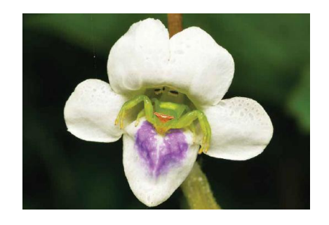
Chocolate Face Crab Spider