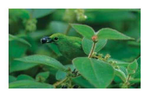
Lesser Green Leafbird