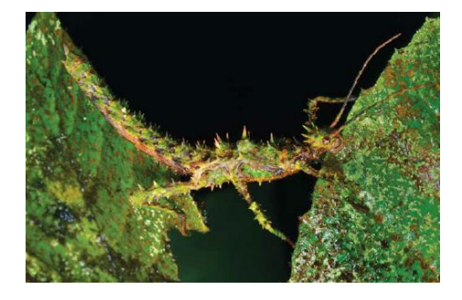
Mueller's Spiny Insect