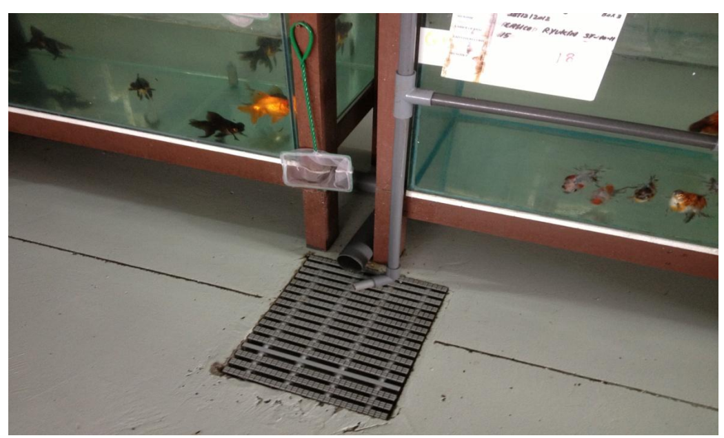
Desirable Practices Floor should be even and have good drainage.