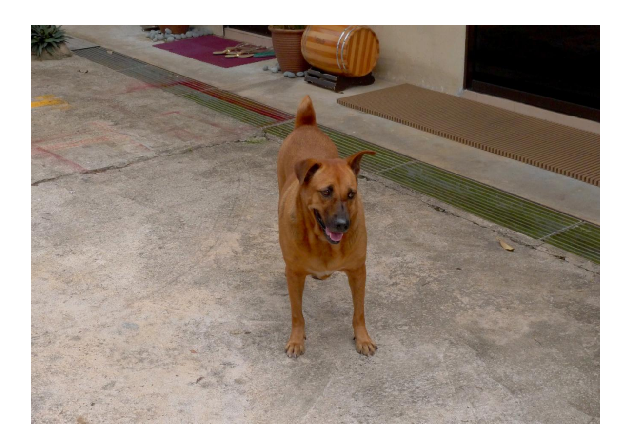
Desirable Practices Pets are not allowed in the quarantine facility.