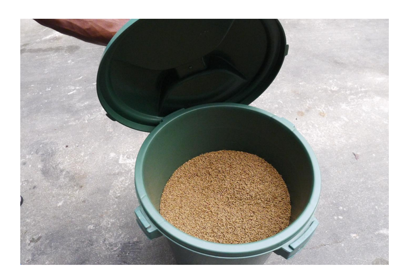
Desirable Practices Fish feed should be properly stored.