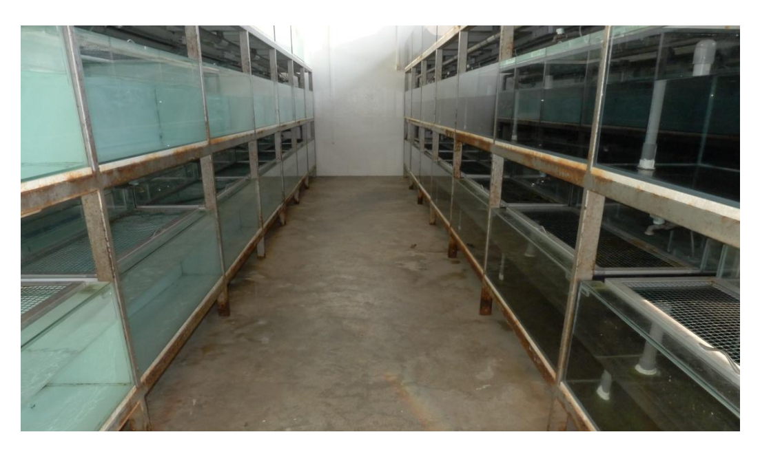
Desirable Practices Keep all tanks clean at all times.