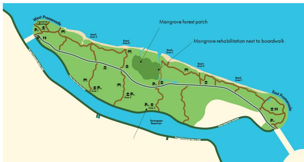
Fig. 13. Location of the mangrove forest.

A patch of mangrove forest on Coney Island Park can be found between Beach Area B and Beach Area C (Fig. 13), where a rivulet brings in seawater to inundate the forest. Mangrove forests, although often regarded as ‘swamps’, are in fact a rich habitat with a high biodiversity. The water here is brackish, a mixture of seawater and freshwater. During the development of Coney Island Park in 2015, a mangrove boardwalk was constructed alongside the rivulet to connect the island’s main paths to Beach Area C.