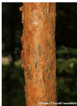
Kelat Merah ( Syzygium filiforme )