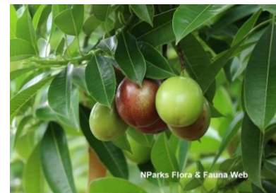
Sea Pong Pong ( Cerbera manghas )