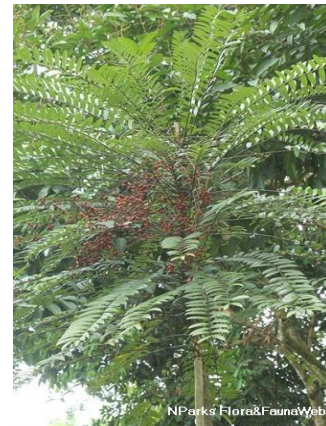
Tongkat Ali ( Eurycoma longifolia )