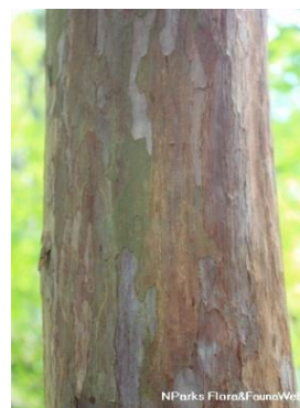
Kayu Arang ( Cratoxylum cochinchinense )