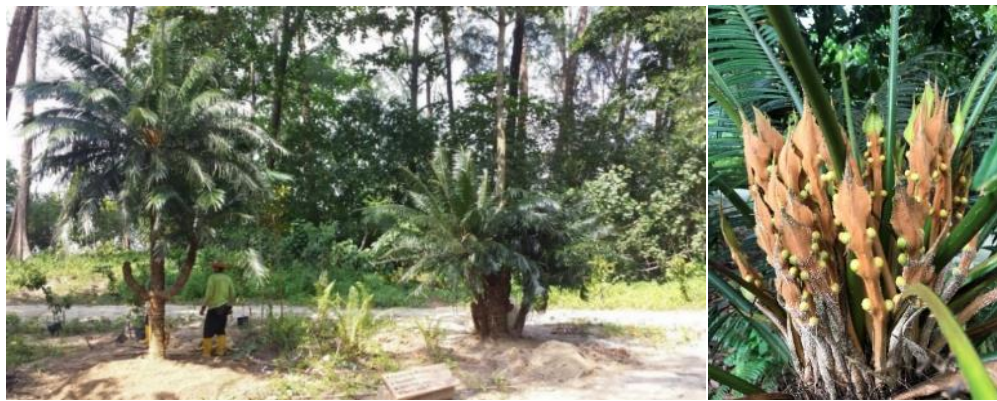
Fig. 4. Cycads on Coney Island Park.

The cycads near Beach C were rescued from a site in Katong that was slated for development and were replanted here in their native beach habitat. Locally rare in the wild, cycads have a long fossil history and typically grow very slowly. Some specimens are believed to have lived for as long as 1,000 years. Cycads do not produce flowers, but instead are cone-bearing.