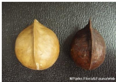
Mangrove Dungun ( Heritiera littoralis )