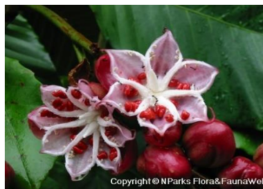
Simpoh Air ( Dillenia suffruticosa )