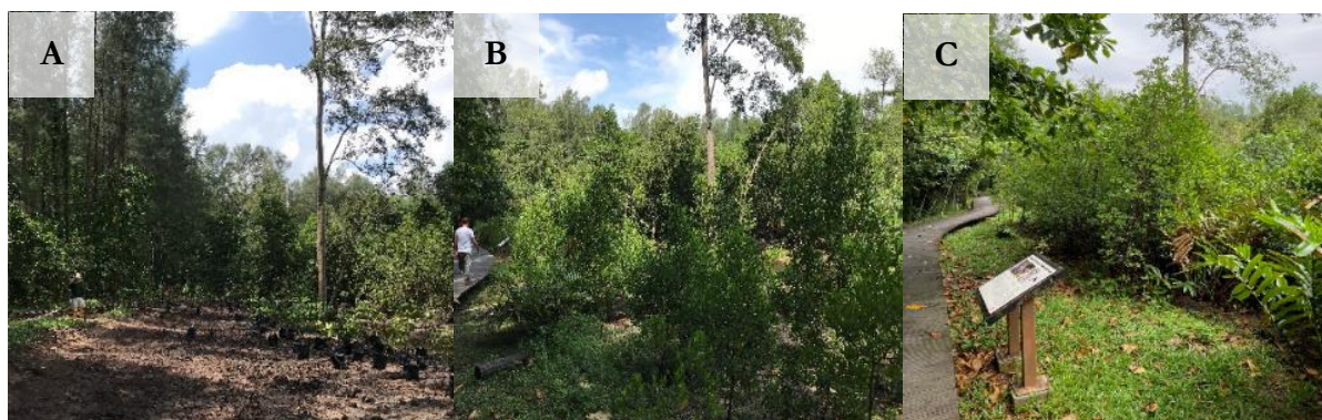
Figs. 21. Progress of the rehabilitated mangrove area as seen through the photos taken at different dates. (A) November 2019; (B) August 2021; (C) June 2023.