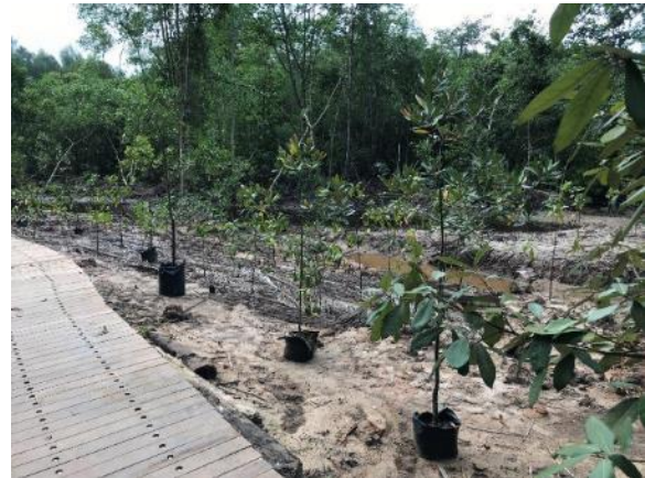
Fig. 17. Preparation for the planting of mangrove saplings.