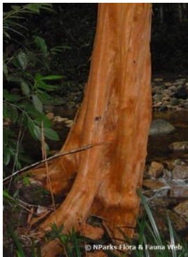
Sea Tristania ( Tristaniopsis obovata )