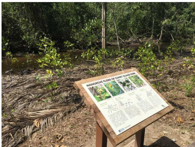
Fig. 20. Installation of educational signs.