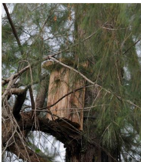
Fig. 22. Nest box on a Casuarina ( Casuarina equisetifolia ).

Four species of resident woodpeckers — Sunda Pygmy ( Dendrocopos moluccensis ), Laced ( Picus vittatus ), Rufous ( Micropternus brachyurus ) and Common Flameback Woodpeckers ( Dinopium javanense ) — have been recorded on Coney Island Park. The Collared Kingfisher ( Todiramphus chloris ) and White-throated Kingfisher ( Halcyon smyrnensis ) are residents on Coney Island Park. Due to woodpeckers' preference for nesting in tree holes, these species face a limited supply of natural nest sites. To increase the availability of suitable nesting sites for kingfishers and woodpeckers, nest boxes were installed on the island (Fig. 22). Bird boxes made from recycled timber were erected on tall trees in a few areas around Coney Island Park. These nest boxes also attracted kingfishers. Officers from NParks' Parks and Design divisions are currently discussing the design of new nest boxes and selection of trees that are most widely used by the birds based on monitoring observations.