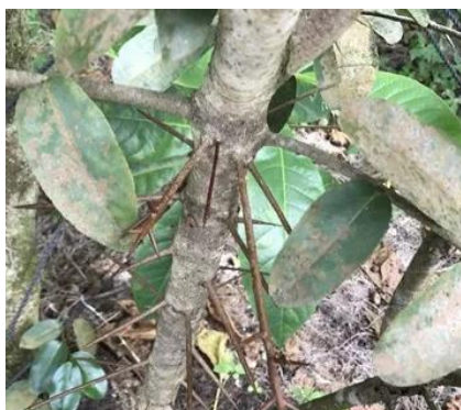
Fig. 6. Pokok Rukam Gajah ( Scolopia macrophylla ).

Native to Singapore, the Pokok Rukam Gajah is a small thorny tree with tooth-edged leaves. The flowers are greenish-white and the fruit matures from orange to black. This is the only species of Scolopia that occurs in Singapore. Once presumed to be locally extinct, it was rediscovered at Coney Island Park in 2014.