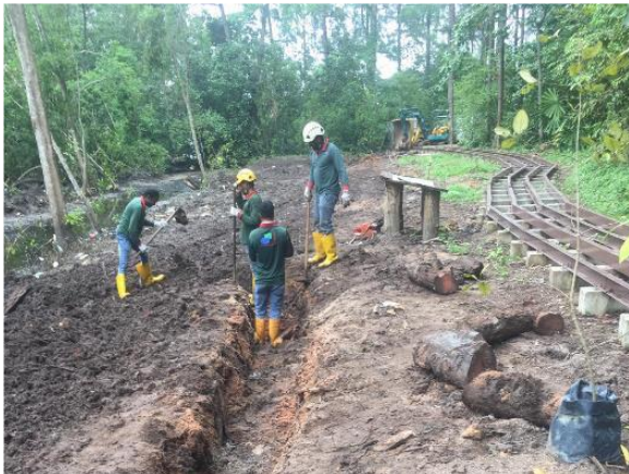
Fig. 16. Trenching of channels to bring in seawater for more areas to be inundated during high tide.