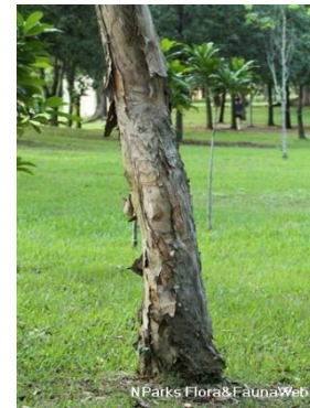
Gelam Tree ( Melaleuca cajuputi )