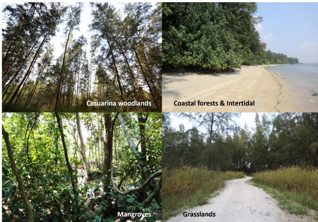
Fig 2. Variety of habitats on Coney Island Park.