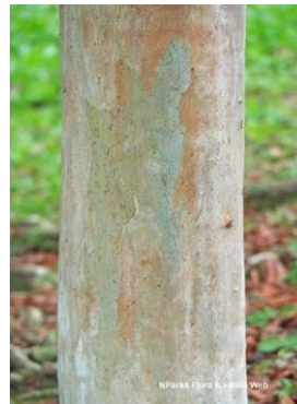
River Tristania ( Tristaniopsis whiteana )