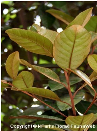
Sea Gutta ( Planchonella obovata )