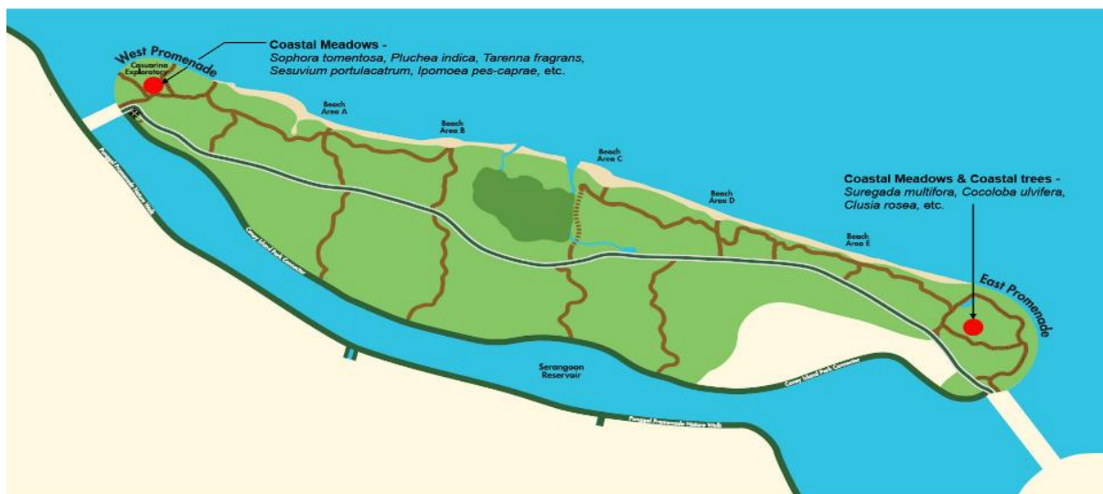
Fig. 7. Map location of the planted coastal meadows.

Coastal meadows were created at two locations on the island (Fig. 7) to enhance species variety and support and increase the island's biodiversity. They contain a selection of free-flowering plants commonly found along the sandy, coastal beaches of Singapore (Fig. 8). These species are well-adapted to the harsh conditions of coastal areas, i.e., strong light exposure, salt spray, and very windy conditions. They serve as an educational tool as well as an enhancement to the island's floral and faunal biodiversity.