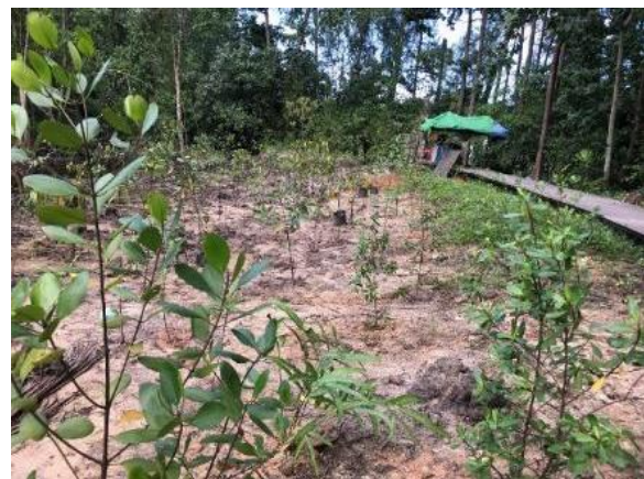
Fig. 19. Newly planted mangrove saplings.