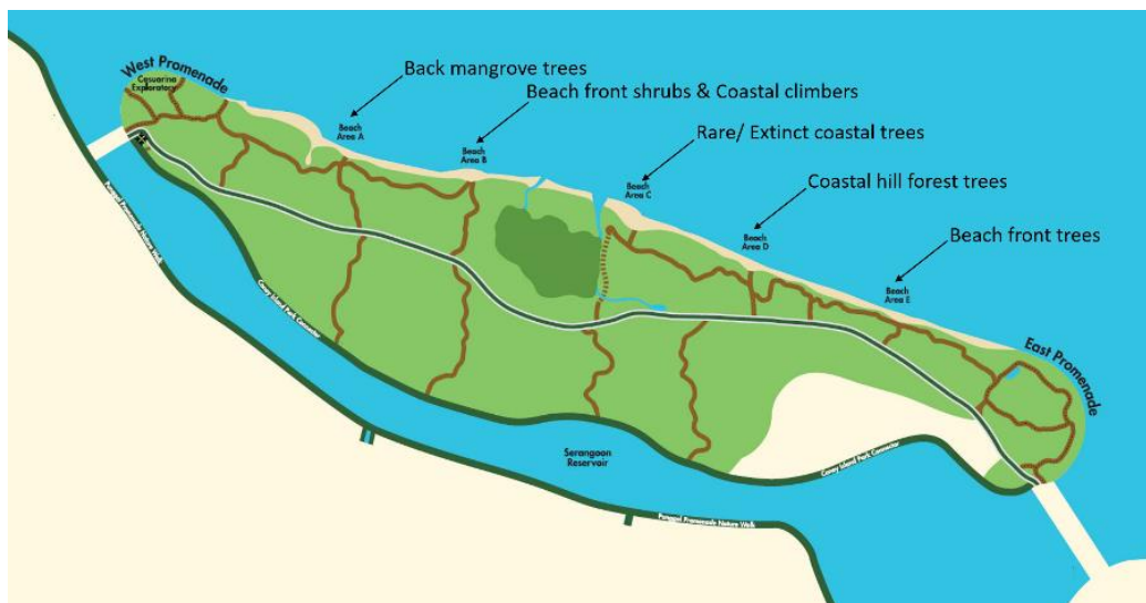
Fig. 3. Location of the five beaches and their themes.

To enhance the floral biodiversity of Coney Island Park, a landscape planting palette was specially curated for various localities on the island. For example, each of the five beach areas in the park was meant to be home to plants of a particular habitat or theme (Fig. 3). The existing vegetation and relationship with sea level were carefully analysed to determine the species of native coastal plants and trees that would be reintroduced into the areas.