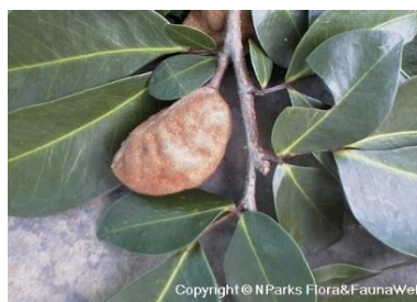
Katong Laut ( Cynometra ramiflora )