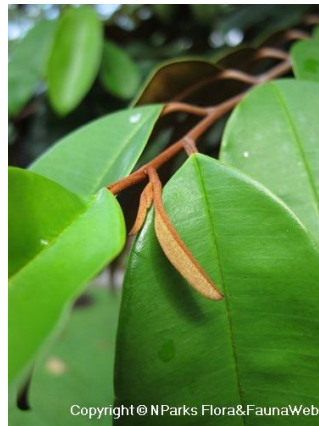
Star Apple ( Chrysophyllum cainito )