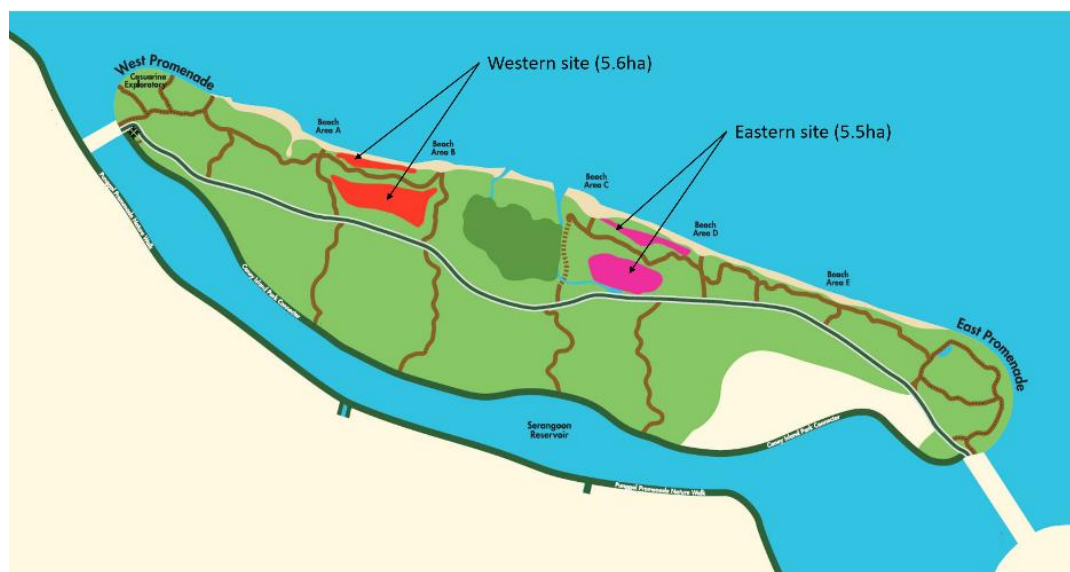
Fig. 23. Reforestation plots on Coney Island Park.

Apart from the habitat enhancement efforts mentioned in the above sections, NParks also embarked on a coastal reforestation project for Coney Island Park. Two plots, totalling 11.1 hectares, adjacent to the mangrove area of the park were dedicated to reforestation (Fig. 23). One of the few long-term monitoring sites in Singapore, Coney Island Park presents a scientific opportunity for NParks to track the success of reforestation efforts over a long period of time.