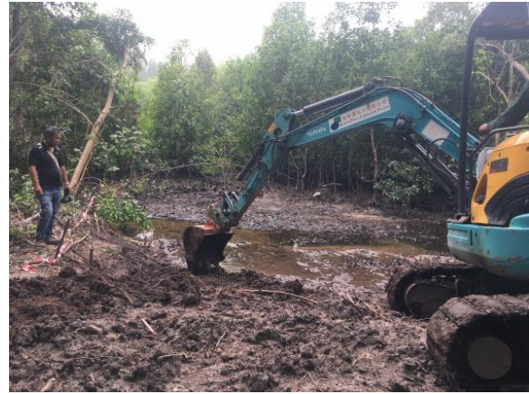
Fig. 15. Regrading of soil to lower the ground level for more areas to be inundated.