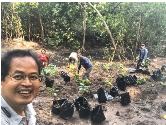
Fig. 18. Planting works in progress.