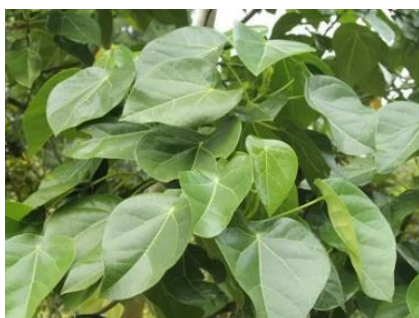
Fig. 5. Sea-hearse ( Hernandia nymphaeifolia ).

The Sea-hearse is an evergreen seashore tree that grows up to 22 m tall. It has long-stalked leaves with somewhat fleshy, leathery blades with yellowish veins and midribs. Growing most commonly along sandy and rocky coasts, the tree bears fragrant, yellowish white flowers. The species is presumed to be extinct in Singapore, and Coney Island Park is the first location where it is being reintroduced into the natural environment.