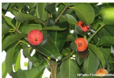
Manggis Hutan ( Garcinia celebica )