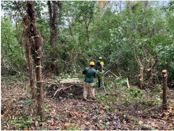
Fig. 14. Clearing of terrestrial species along the rivulet.