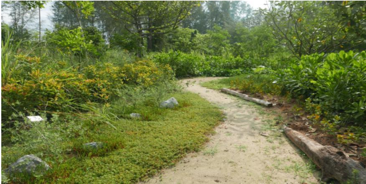
Fig. 8. One of the coastal meadows on Coney Island Park.