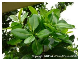
Penaga Laut ( Callophyllum inophyllum )