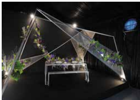
An aluminium structure provided a counterpoint to the floral displays.

To Be took a futuristic outlook on preserving nature: that if mankind stays united in this endeavour, human life will be sustainable for generations to come. The use of aluminium provided an edge to the design, a surface for the organic flowers to curl around.