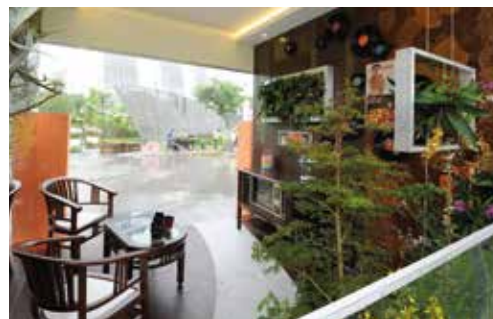
Retro furniture and decorations, together with the greenery spilling into the house, harked back to a tranquil village life of yesteryear.