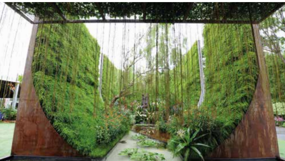
Five-metre-high walls enclosed a cocoon of greenery and water.