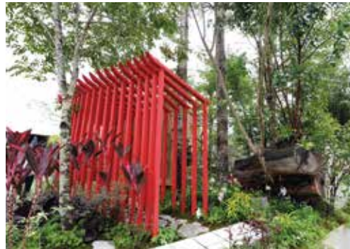
En showcased the belief that people who appreciate nature are dedicated to offering help to those in need.

The garden En showcased scenes inspired by a series of homonyms that are all read as “en” in Japanese, which can mean a special place, play, uninterrupted peace, receptiveness to living in harmony, or even a connection with people. Elements of Japanese tea culture also featured prominently in the setting.