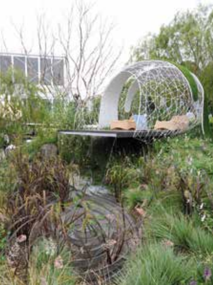
A pod shelter tucked away into a bank harmonised the best of nature and man.

Drawing inspiration from the world’s tug-of-war between the man-made and the environment, Back to Nature sought to integrate both elements into a single setting. A man-made pod shelter with seating nestled within a natural landscape of meadow plants, embraced by living “tentacles” enveloping the structure. The water feature represented the vibrancy of life, where an artwork installed within the pond hinted at man’s fingerprint on the planet, and was an integral part of the transformed natural landscape.