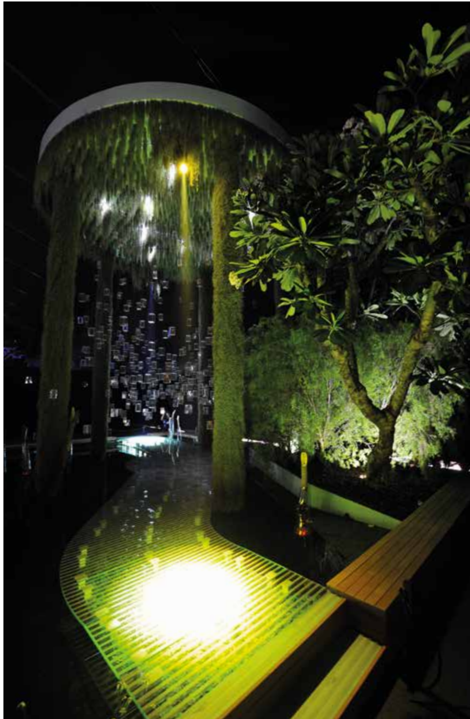
Nature's Resolution guided visitors through the relationship between nature and man in everyday life.

A day in the human life was illustrated in this garden, where visitors become immersed in nature the moment they stepped in. Aquatic elements featured prominently in Nature's Resolution , and the plants were specially selected due to their benevolent qualities: the Bacopa monnieri is used as a medicinal herb, while the Tillandsia helps to purify the air. The garden served to illustrate the relationship between man and nature, with story boxes filled with suggestions and thought-provoking sketches throughout. Chinese instrumentals in the background transported visitors back to the past; a replica forest on display demonstrated how nature is suffering today as a result of the actions of mankind.