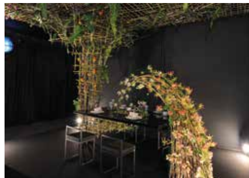
The floral display arching gracefully over the table setting demonstrated a distortion in the environment.

The merging of energies from seemingly different worlds served as the inspiration for Coming Together , where balance was created where they meet. The surroundings were stretched, distorted, and then combined together to form a single transient moment.