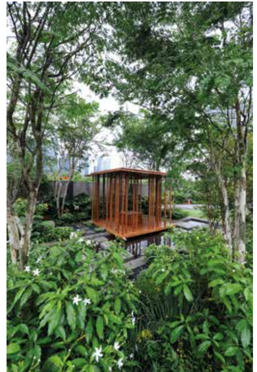
Created for the busy lives of a city-dwelling couple, An Urban Jungle offered a relaxing space to connect with nature.

Like its name, An Urban Jungle married the built environment with the natural world. A pergola provided a strong focal point—dominant concrete lines reinforcing the play between shadow, light and reflection—amidst nature reminiscent of the English spring. Gravel paths cut through the garden nook, stressing the importance of greenery in an increasingly modernised world.