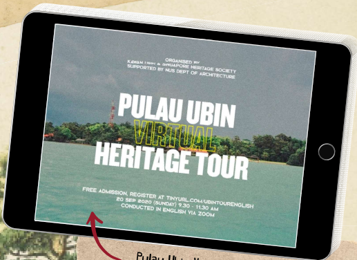
Pulau Ubin Virtual Heritage Tour organised by Kawan Ubin

There were also four on-site activities, which were conducted separately by Cicada Tree Eco-Place; Singapore Teochew Group; Nature Photographic Society, Singapore; and U Cares Volunteers. Participants explored the island and experienced its rustic and natural charm. Some even got the opportunity to plant trees in support of reforestation efforts and the OneMillionTrees movement. All the activities were conducted with adherence to the prevailing Safe Management Measures.