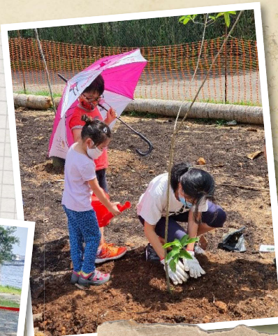
Participants planting a tree at Jalan Jelutong

There were also four on-site activities, which were conducted separately by Cicada Tree Eco-Place; Singapore Teochew Group; Nature Photographic Society, Singapore; and U Cares Volunteers. Participants explored the island and experienced its rustic and natural charm. Some even got the opportunity to plant trees in support of reforestation efforts and the OneMillionTrees movement. All the activities were conducted with adherence to the prevailing Safe Management Measures.