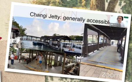
Screenshots from Ubin Day webinars on 26 September 2020