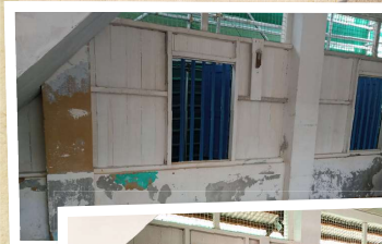
House No. 40's interior wall — before repair works (top) and after completion in August 2021 (bottom)