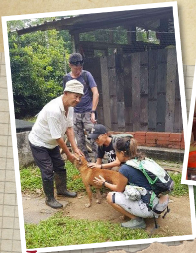
SOSD volunteers conducting an Ops Vax Lyssa exercise in November 2019 (photograph taken prior to COVID-19)

Two exercises were carried out in November 2019 and July 2021. Out of a population of about 40 dogs in Pulau Ubin, 27 dogs have already been vaccinated. Ops Vax Lyssa will continue yearly to ensure that the dogs on Pulau Ubin are safe from rabies. We hope to vaccinate the remaining dogs within the next two years.