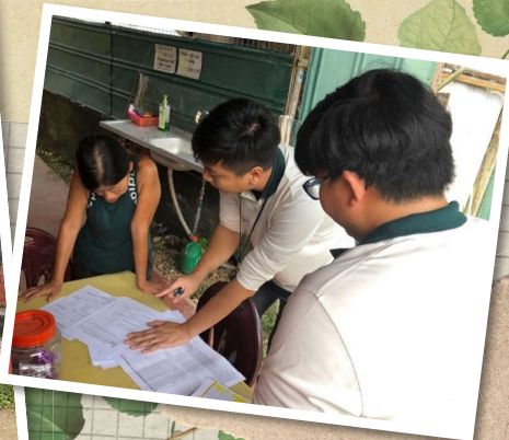
NParks staff assisting a villager in applying for a dog licence (photograph taken prior to COVID-19)