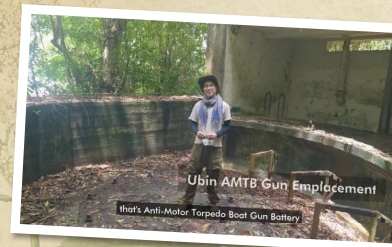
Screenshot of a virtual tour of the Anti-Motor Torpedo Boat Gun Battery