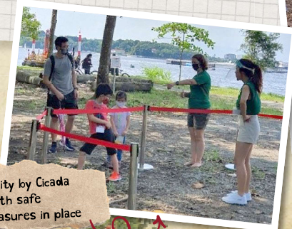
Storytelling activity by Cicada Tree Eco-Place, with safe management measures in place