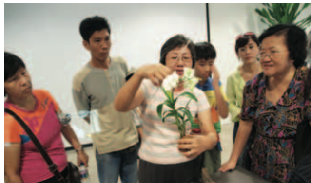
In 2009, more than 4,500 events were held in our parks and gardens. These include public events such as hands-on gardening workshops, conservation talks, and nature art sessions for adults and children.

NParks and MOE also collaborated on the Teachers Work Attachment Programme. This programme gives teachers exposure to other areas of the public service and enables both agencies to leverage on each other's experiences and resources. This year, teachers were attached to various branches in NParks.