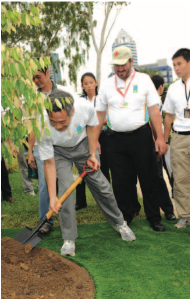
At the launch of CGS 2010 on 30 October 2009, Prime Minister Lee Hsien Loong planted a Bayur Bukit ( Schoutenia accrescens ) tree in HortPark.

Also launched at CGS 2010 was the second edition of Trees of Our Garden City , which covers a wide range of the urban trees commonly encountered in Singapore. Besides 150 trees and palms in full colour, this book also features three new chapters – ‘Our Garden City Story’, ‘Tree Biology’, and ‘Trees and the Environment’ – which provide readers with a broader perspective of the functions of trees in Singapore.