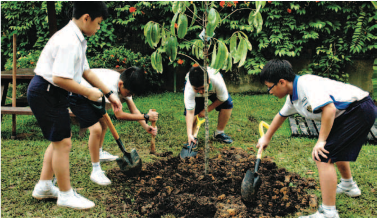
Children from St Gabriel's Primary School planted three native trees of Singapore on their school grounds, as their contribution to the global Green Wave campaign.