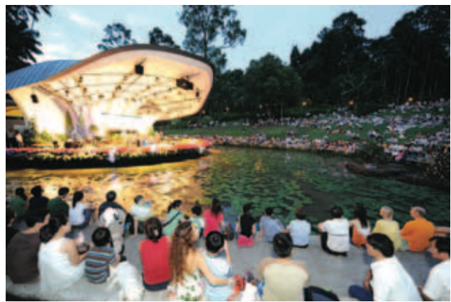
The Singapore Botanic Gardens’ 150th anniversary celebrations wrapped up on a high note with The Botanical Party , a spectacular night-time birthday bash attended by over 5,000 members of the public.

Adding yet more fanfare and joy to her birthday, the Botanic Gardens shared the happiness of 168 couples who took their marital vows in its premises on 20 September 2009, or 20-09-2009, earning herself a place in the Guinness World Records for “Most couples married in 24 hours (single location)”. Aptly named the Garden Weddings 2009 ceremony, the blissful occasion was jointly organised by Lianhe Wanbao, People’s Association, and the Singapore Botanic Gardens.