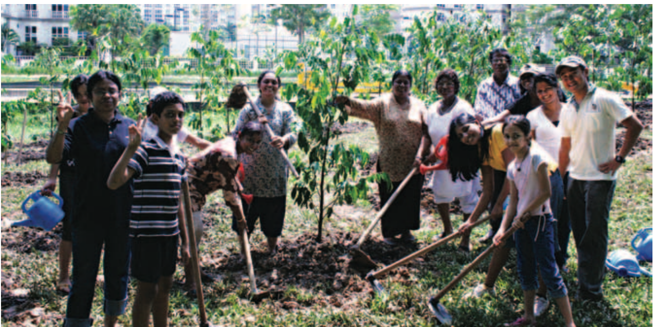
The act of tree planting has taken root among many environmentally conscious individuals and groups, such as the Amriteswari Society (pictured above).

The programme has received considerable support from corporations with their own green campaigns. One such organisation is Citibank. In partnership with the GCF, Citibank pledged to plant a tree for every 100 customers who opted for electronic statements instead of paper ones. Over 400 Citibank employees and their families planted 1,000 trees along the Changi Coastal Park Connector on 23 August 2009, as part of this campaign.