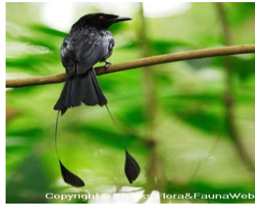
Greater Racket-tailed Drongo