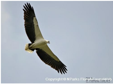
White-bellied Fish Eagle