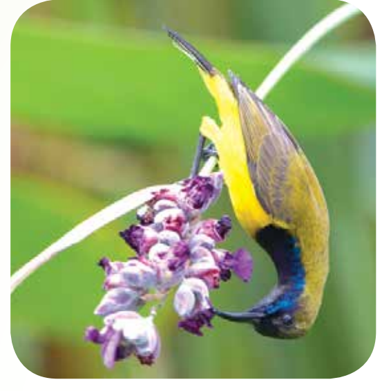
Olive-backed Sunbird (Male)

There are over 390 species of birds in Singapore. Here are a few common species that can be found in urban areas.