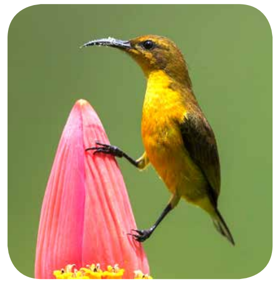
Olive-backed Sunbird (Female)