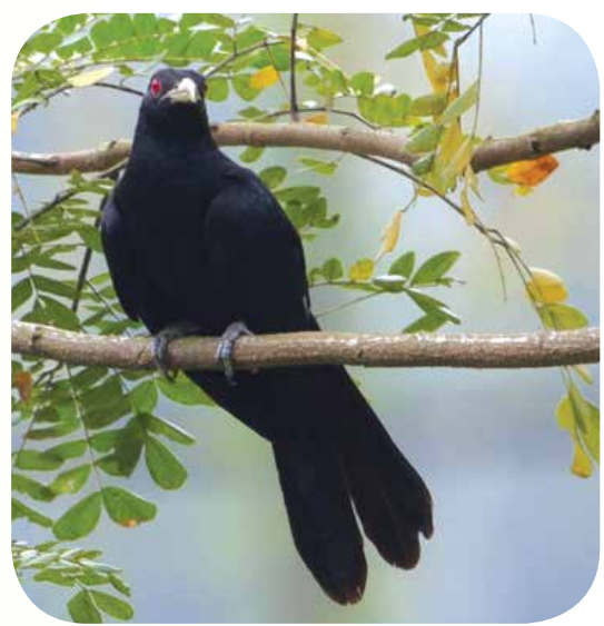
Asian Koel (Male)

The Asian Glossy Starling often gathers in large flocks. It feeds on fruit and small insects.