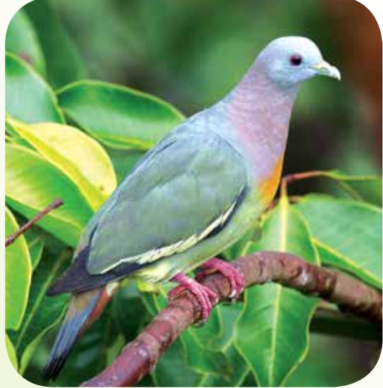
Pink-necked Green Pigeon (Male)

The Yellow-vented Bulbul feeds on a variety of fruit and small animals. It has a distinctive bubbly song.