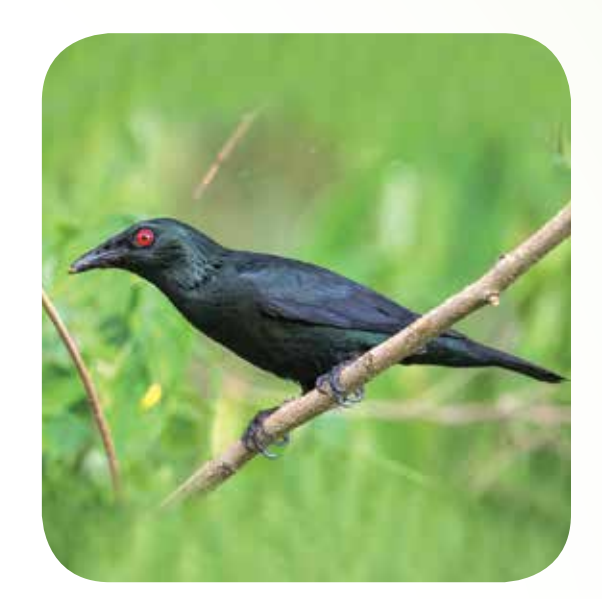
Asian Glossy Starling

The Eurasian Tree Sparrow is often seen near human dwellings, where it forages on leftovers and nests in the eaves of buildings.