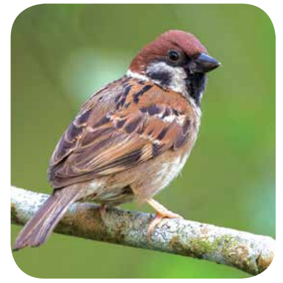
Eurasian Tree Sparrow

The Black-naped Oriole often forages for fruit in tall trees. Its nest can be seen hanging from branches in the canopy of the trees.