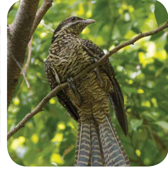
Asian Koel (Female)