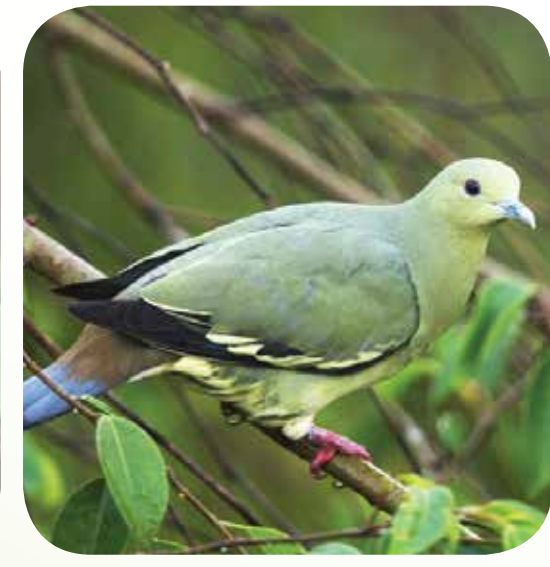
Pink-necked Green Pigeon (Female)