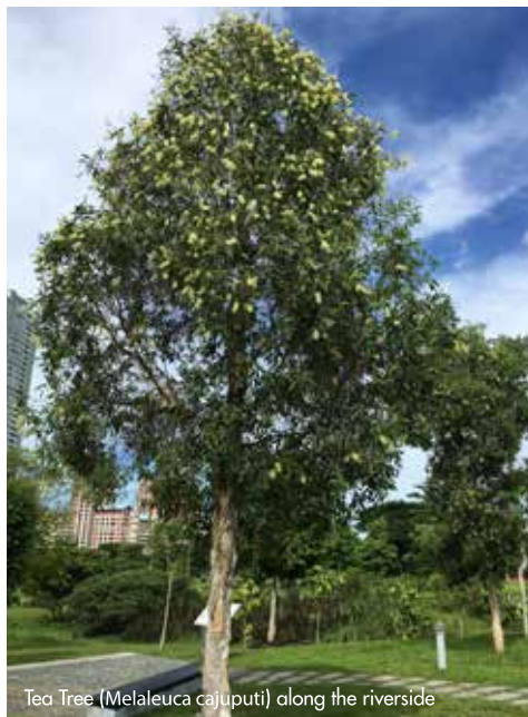
Tea Tree ( Melaleuca cajuputi ) along the riverside