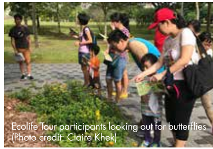
Ecolife Tour participants looking out for butterflies

Spanning a total of 0.3 hectares, the Community and Herb Gardens at Bishan-Ang Mo Kio Park were established more than 20 years ago. They house many types of edible, ornamental plants and herbs with traditional and medicinal uses. Situated just a stone's throw away from Bishan Road, they are maintained by passionate volunteer gardeners. Since 2014, the gardeners of the Herb Garden have participated in the biennial NParks' Community in Bloom Awards, and the Herb Garden received a Gold Award in 2018.