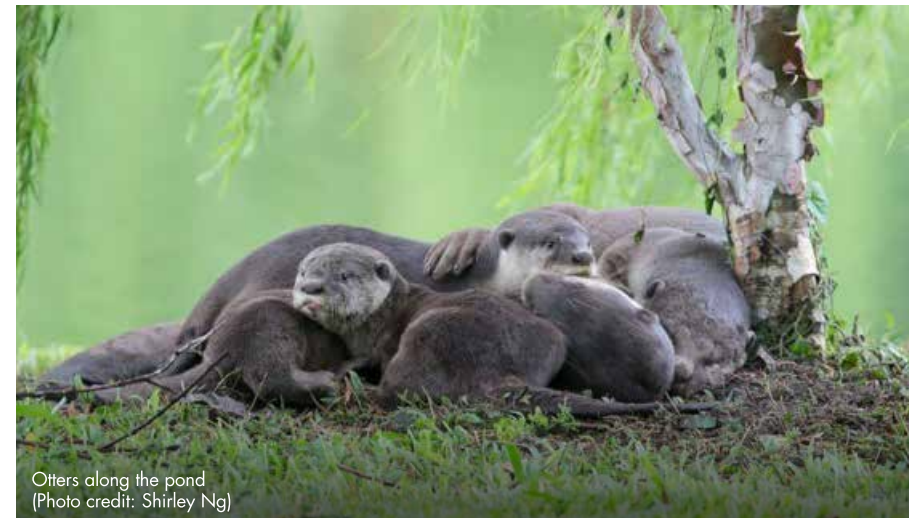
Otters along the pond

In 2015, a family of Smooth-coated Otters ( Lutrogale perspicillata ) started appearing in the park. They can be sighted in the park occasionally, travelling upstream to Lower Peirce Reservoir Park and downstream to Marina Barrage. They are usually seen feeding at the Landscape Pond in the Pond Gardens.