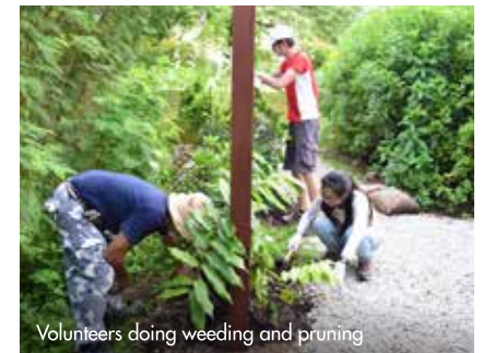
Volunteers doing weeding and pruning