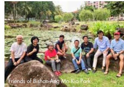
Friends of Bishan-Ang Mo Kio Park