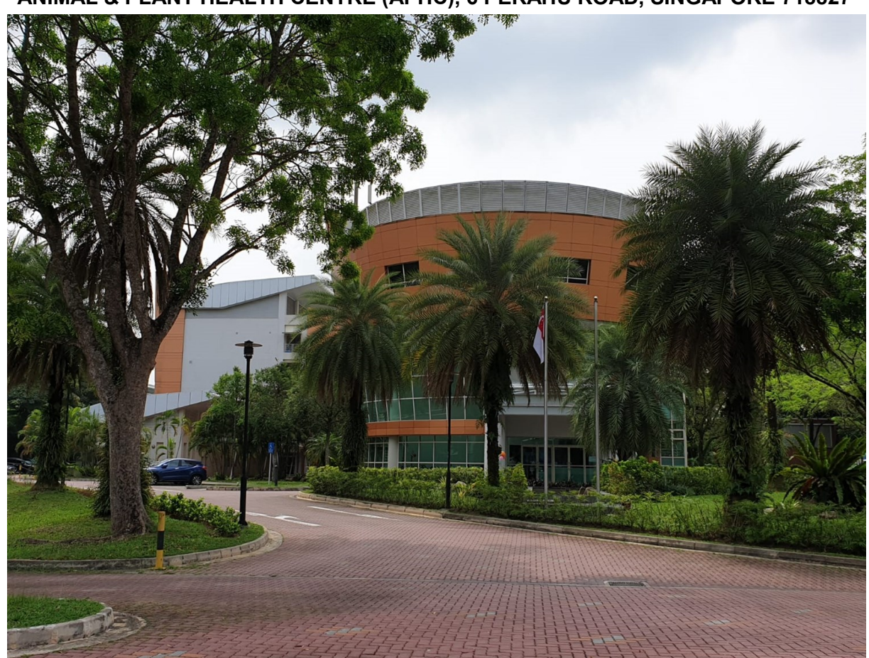
ANIMAL & PLANT HEALTH CENTRE (APHC), 6 PERAHU ROAD, SINGAPORE 718827