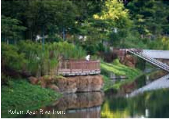
PARKS – GOLD AWARD

This year, there were a total of 29 submissions for the SILA awards under seven categories. The winning entries are: