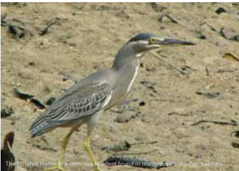
The Striated Heron is a common resident found in mangroves and other habitats.