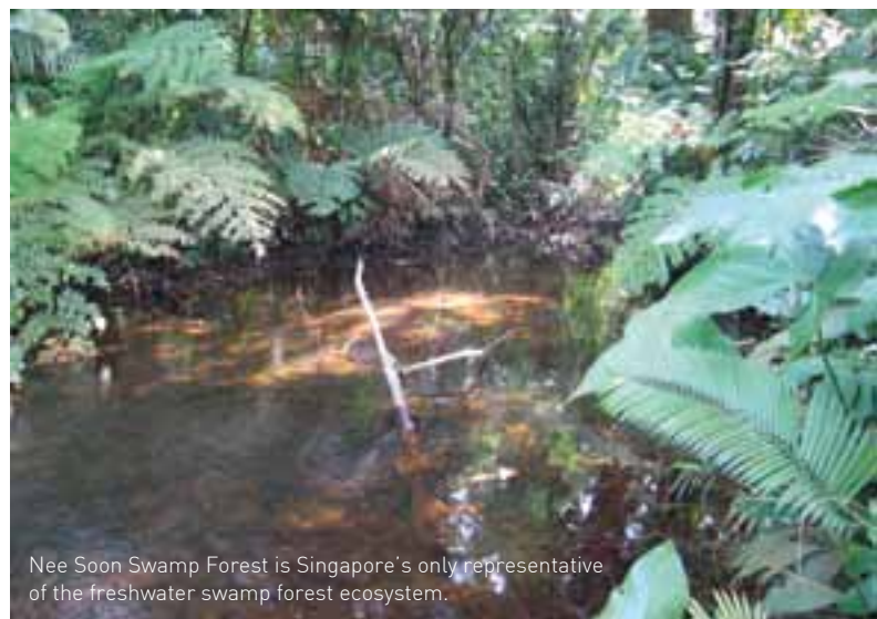
Nee Soon Swamp Forest is Singapore's only representative of the freshwater swamp forest ecosystem.