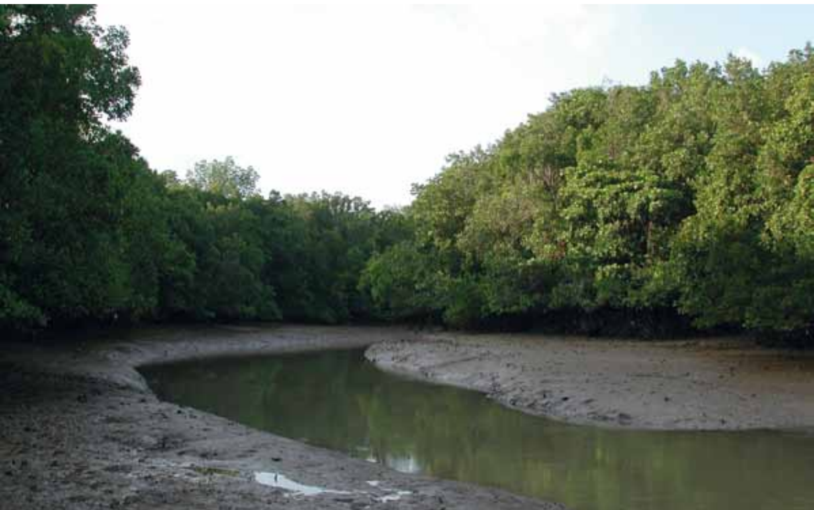
ABOVE Ecosystems along parts of Singapore's natural shores include mudflats and mangroves. RIGHT Volunteers participate in Team Seagrass monitoring.