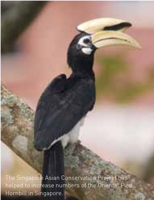
The Singapore Asian Conservation Project has helped to increase numbers of the Oriental Pied Hornbill in Singapore.