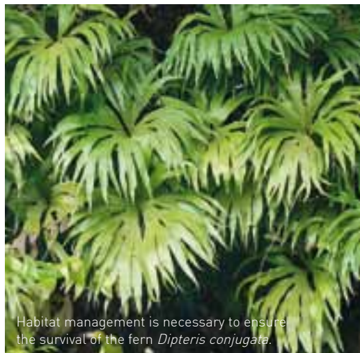
Habitat management is necessary to ensure the survival of the fern Dipteris conjugata .