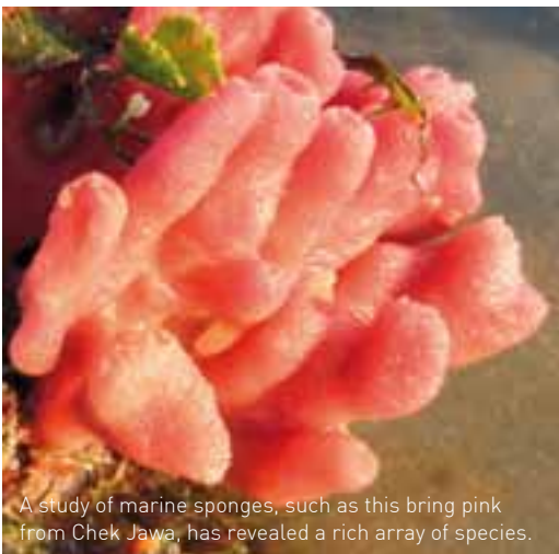
A study of marine sponges, such as this bring pink from Chek Jawa, has revealed a rich array of species.