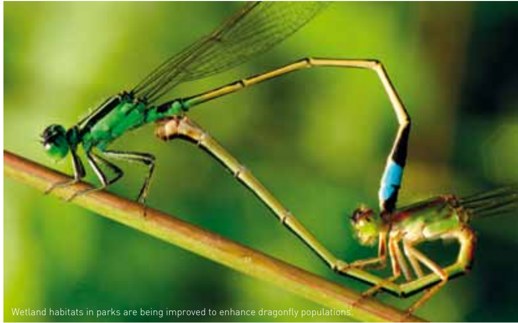
Wetland habitats in parks are being improved to enhance dragonfly populations.