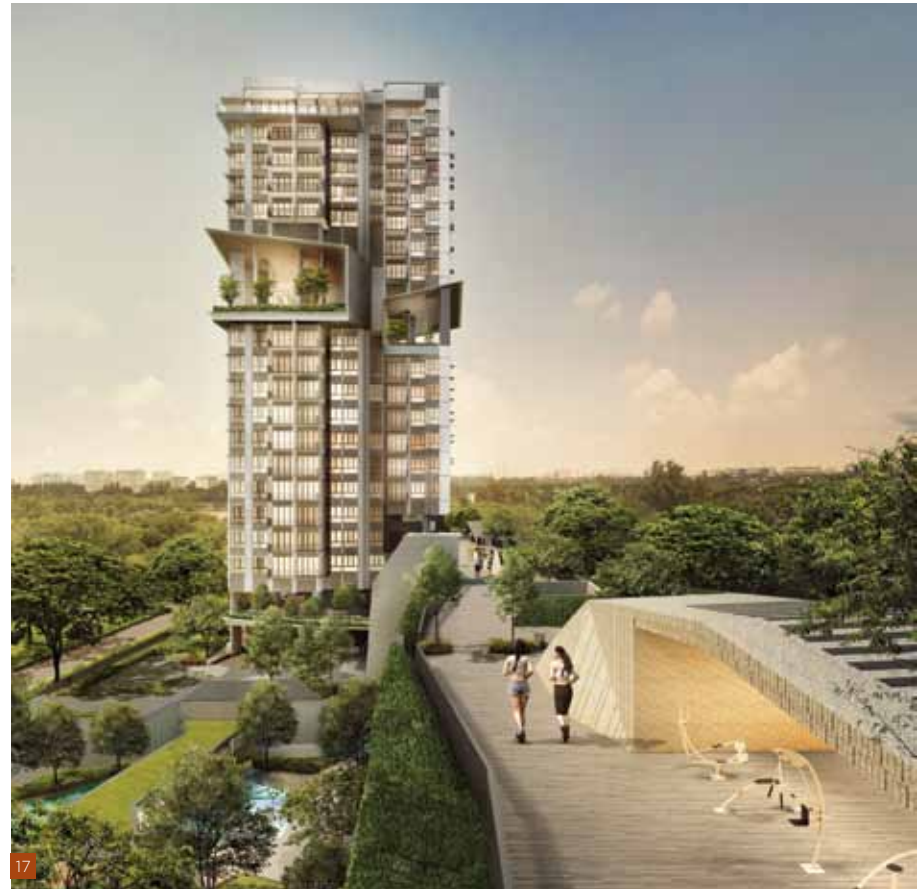
16. 17. Highline Residences features an elevated green ridge on level five, which will host recreational facilities and connect seamlessly with the landscape on the ground floor.