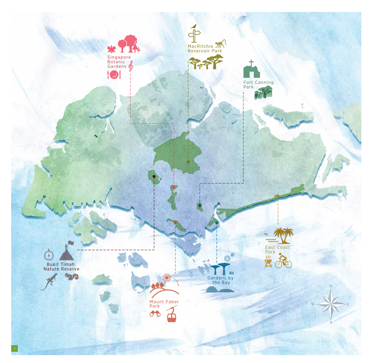
Tourists' Perceptions of Parks and Gardens in Singapore