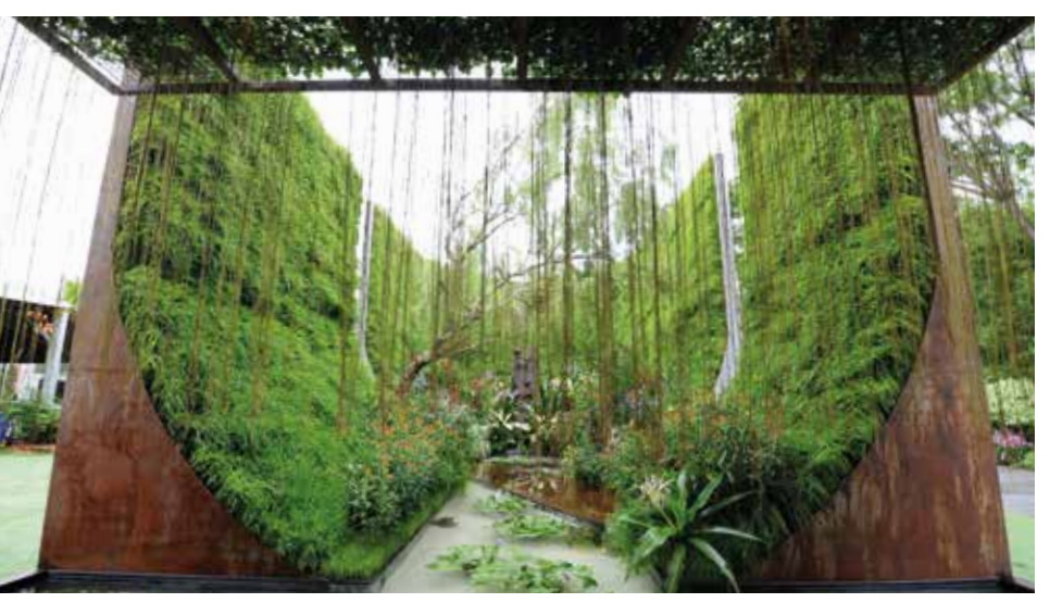
Five-metre-high walls enclosed a cocoon of greenery and water.