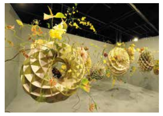
Folded, bent, and cut, paper provided the ideal centrestage for the floral displays.