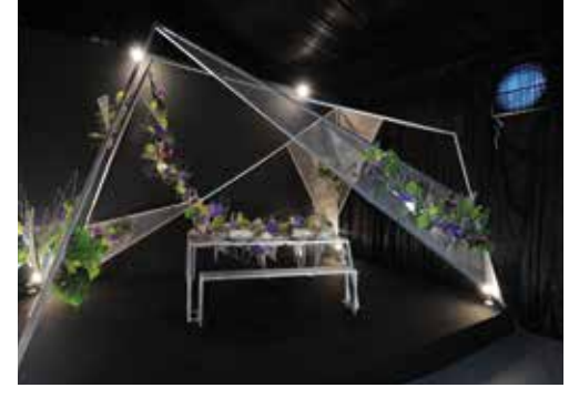
An aluminium structure provided a counterpoint to the floral displays.