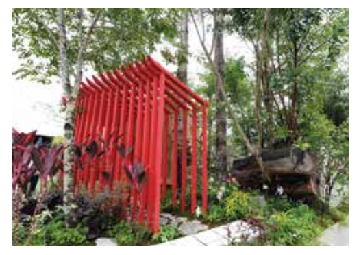
En showcased the belief that people who appreciate nature are dedicated to offering help to those in need.

The garden En showcased scenes inspired by a series of homonyms that are all read as "en" in Japanese, which can mean a special place, play, uninterrupted peace, receptiveness to living in harmony, or even a connection with people. Elements of Japanese tea culture also featured prominently in the setting.