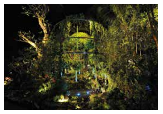
An extravaganza of greenery proved the true power and might of the Earth.

Power of the Earth took its name from an ageold practice of mankind since the ancient times: gaining power from the Earth in spiritual locations. The garden emphasised a different kind of power: the energy of nature and the Earth, allowing visitors to experience the "power" of Nature without the spiritual training.