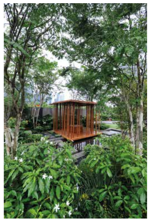
Created for the busy lives of a city-dwelling couple, An Urban Jungle offered a relaxing space to connect with nature.

Like its name, An Urban Jungle married the built environment with the natural world. A pergola provided a strong focal point—dominant concrete lines reinforcing the play between shadow, light and reflection—amidst nature reminiscent of the English spring. Gravel paths cut through the garden nook, stressing the importance of greenery in an increasingly modernised world.