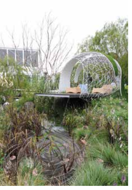
A pod shelter tucked away into a bank harmonised the best of nature and man.