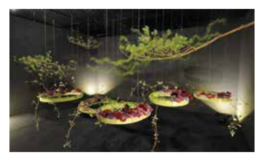
A blend of cutting-edge arrangement and a finely honed sensibility elevated Synesthesia beyond the senses.