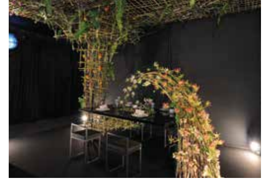
The floral display arcing gracefully over the table setting demonstrated a distortion in the environment.

The merging of energies from seemingly different worlds served as the inspiration for Coming Together , where balance was created where they meet. The surroundings were stretched, distorted, and then combined together to form a single transient moment.