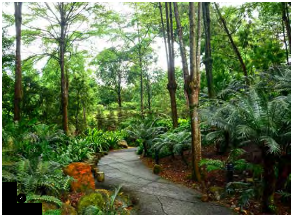
3, 4. Evolution Garden in the Singapore Botanic Gardens