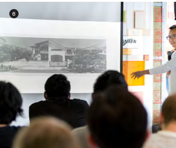
Design for Time Addresses the Lifespan of Building Design

The reality of construction in Singapore is that there is a continual contest on whether the old should make way for the new, in the name of progress. There is also a need for a mind-set shift, from designing buildings which will soon deteriorate and be demolished, to designing for the long haul.