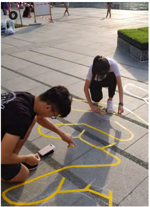
Design for Environment Enhances the Life of our Planet, Flora and Fauna

In other cases of under-utilised spaces, proposals were made to give them a "second-life", which in turn would rejuvenate the built environment and encourage community cohesion