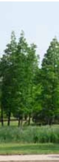
TOP AND MIDDLE ROWS Expo Park. BOTTOM ROW Senlin Park.