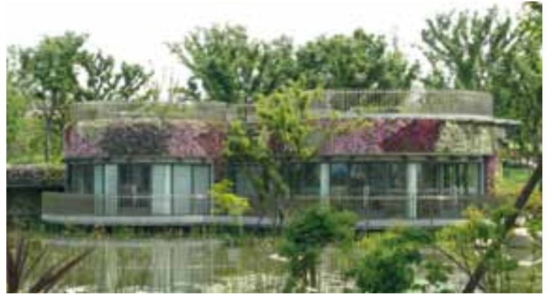
OPPOSITE Senlin Park (Photo: City Weekend Shanghai).

It's also common to see park users rubbing trees, in the belief that they will be able to absorb some of the fauna's life force by osmosis.