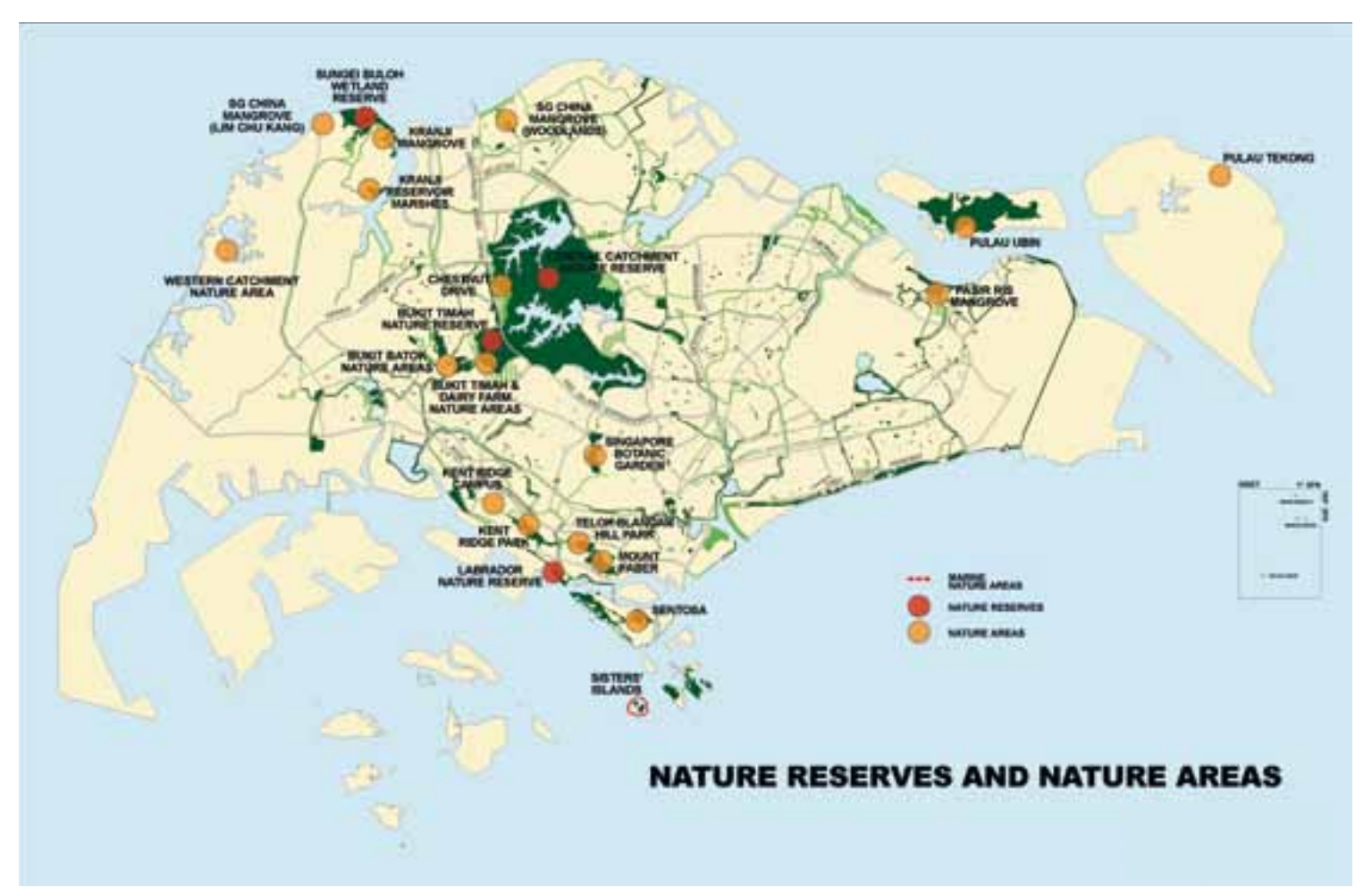
ABOVE Parks and Waterbodies Plan.

In 2002, URA and National Parks Board (NParks) drew up the Parks and Waterbodies Plan to guide the development of our Parks for the next ten to fifteen years. The Plan looked at bringing Singaporeans closer to green spaces and waterfront areas on an island-wide basis. Extensive consultations were also carried out with the local grassroots and community on the plans.