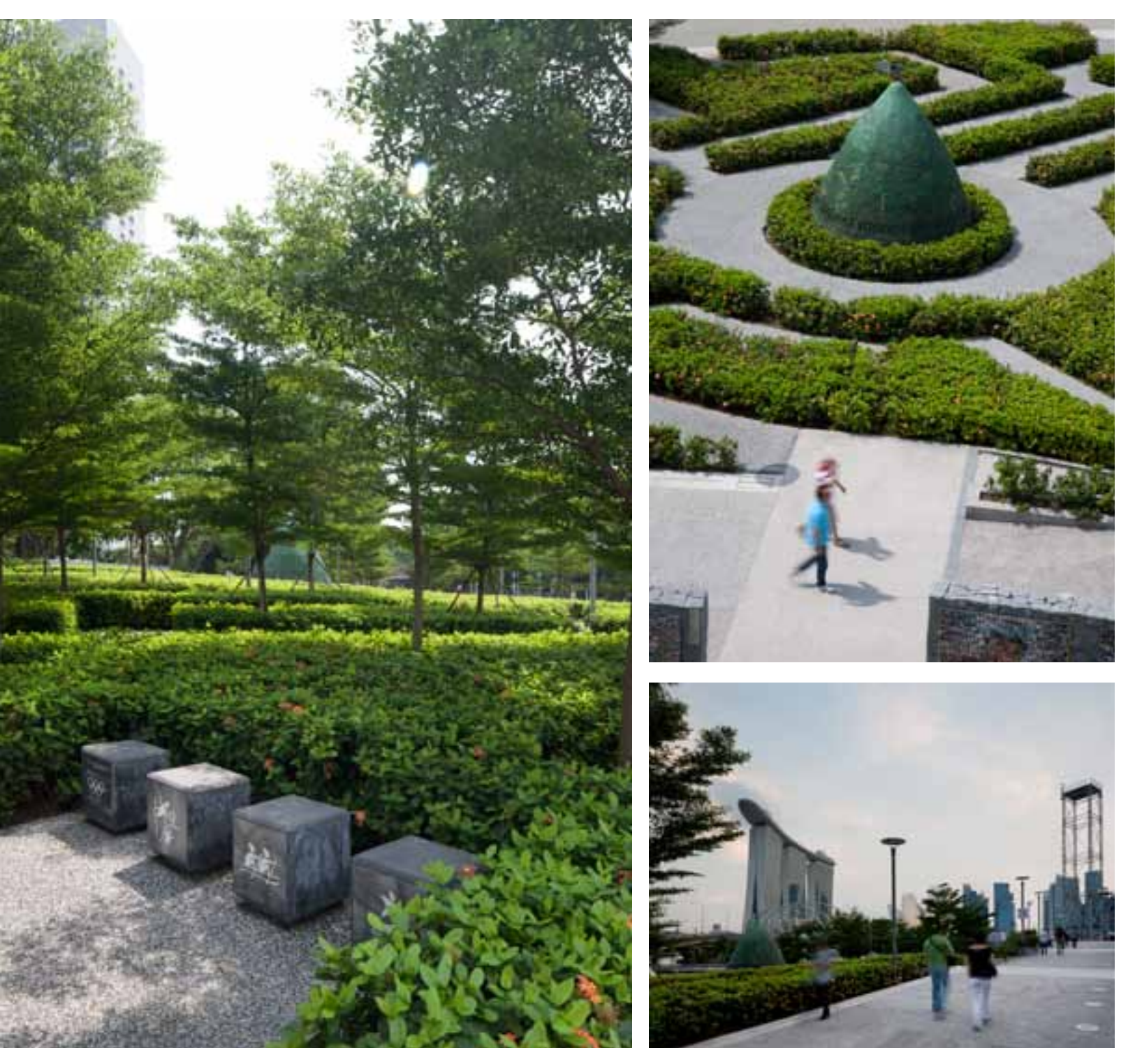
OPPOSITE & ABOVE, ALL Youth Olympic Park.