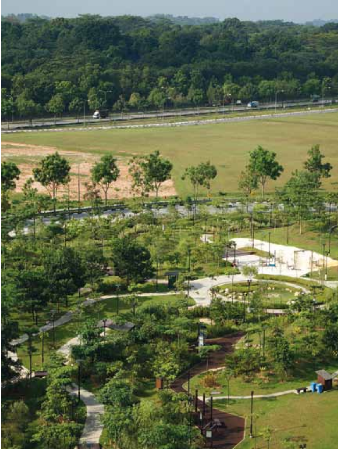
LEFT Greenwood Sanctuary @ Admiralty