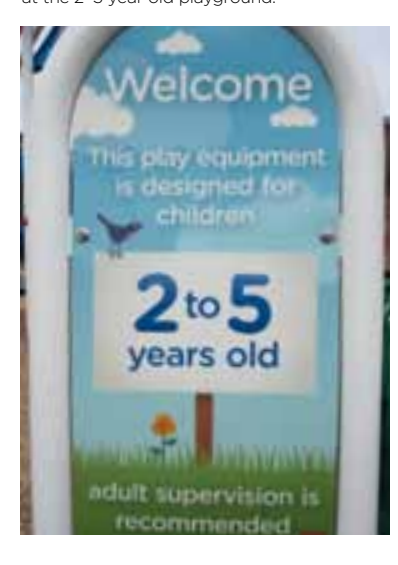
BELOW Fig. 1. A clear sign designating playground appropriateness by age. OPPOSITE Fig. 2. Access to an upper area at the 2-5 year old playground.

"Risk" can also be defined: it is the probability of a hazards-related event occurring and the severity of injury if the event occurs. Our work and our thoughts need to be about risk. Managing risk is about decreasing the probability of an unpleasant event occurring and mitigating the severity of the injury should that event occur. Because most injury producing accidents are rare, many become complacent when faced with risks they should be defining as unacceptable. It is this normal phenomenon of complacency that makes design and pre-planning so important. The underlying theme whenever you are judging something,