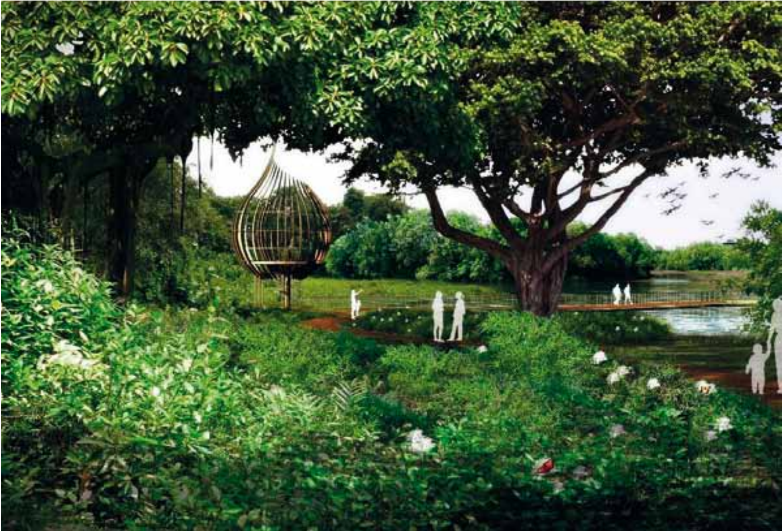
ABOVE Observation Hide.