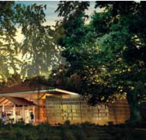
ABOVE Overview of Visitor Centre. LEFT Recreation & Education Centre.