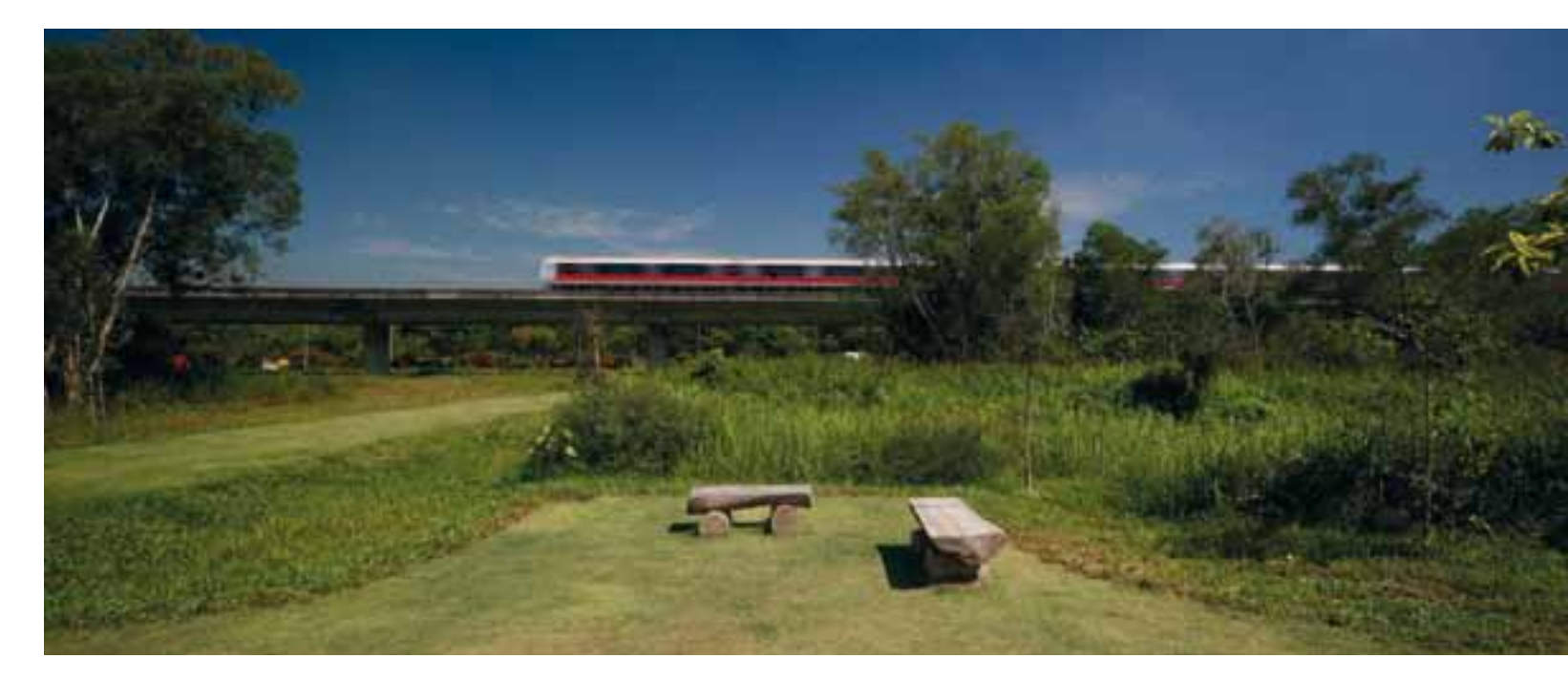
ABOVE The urban landscape must be understood as a piece of a city's infra-structure, as we would view our transportation.