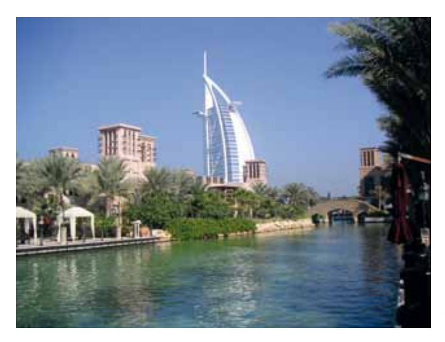
LEFT The value for urban landscape within a city stands in stark contrast to the architecture-led buildings of Dubai" (Photo: National Parks Board, Singapore; Photography: Chuah Hock Seong).