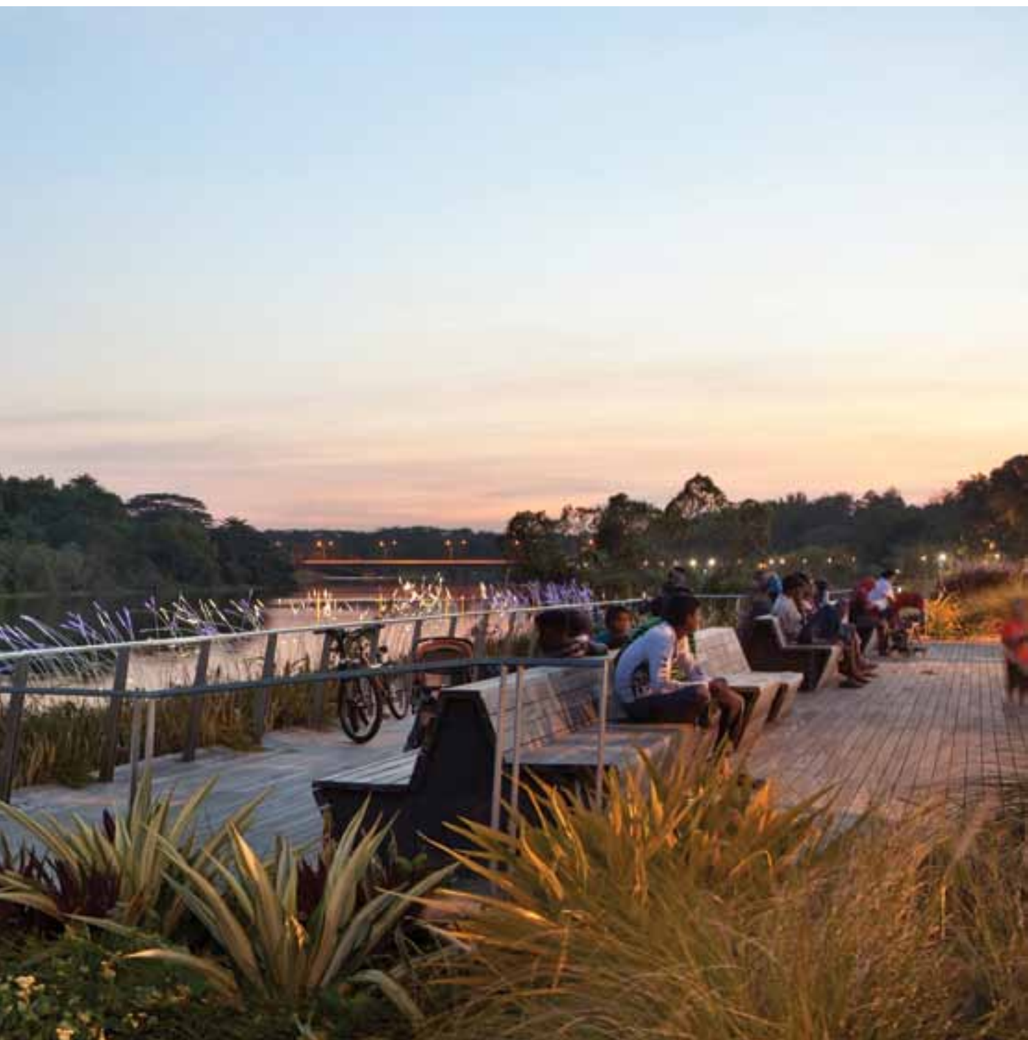
11. The lushly vegetated edge of look-out decks, projected over the existing embankment, blends the structures into their surrounding natural landscape (Photo: Frank Pinckers).