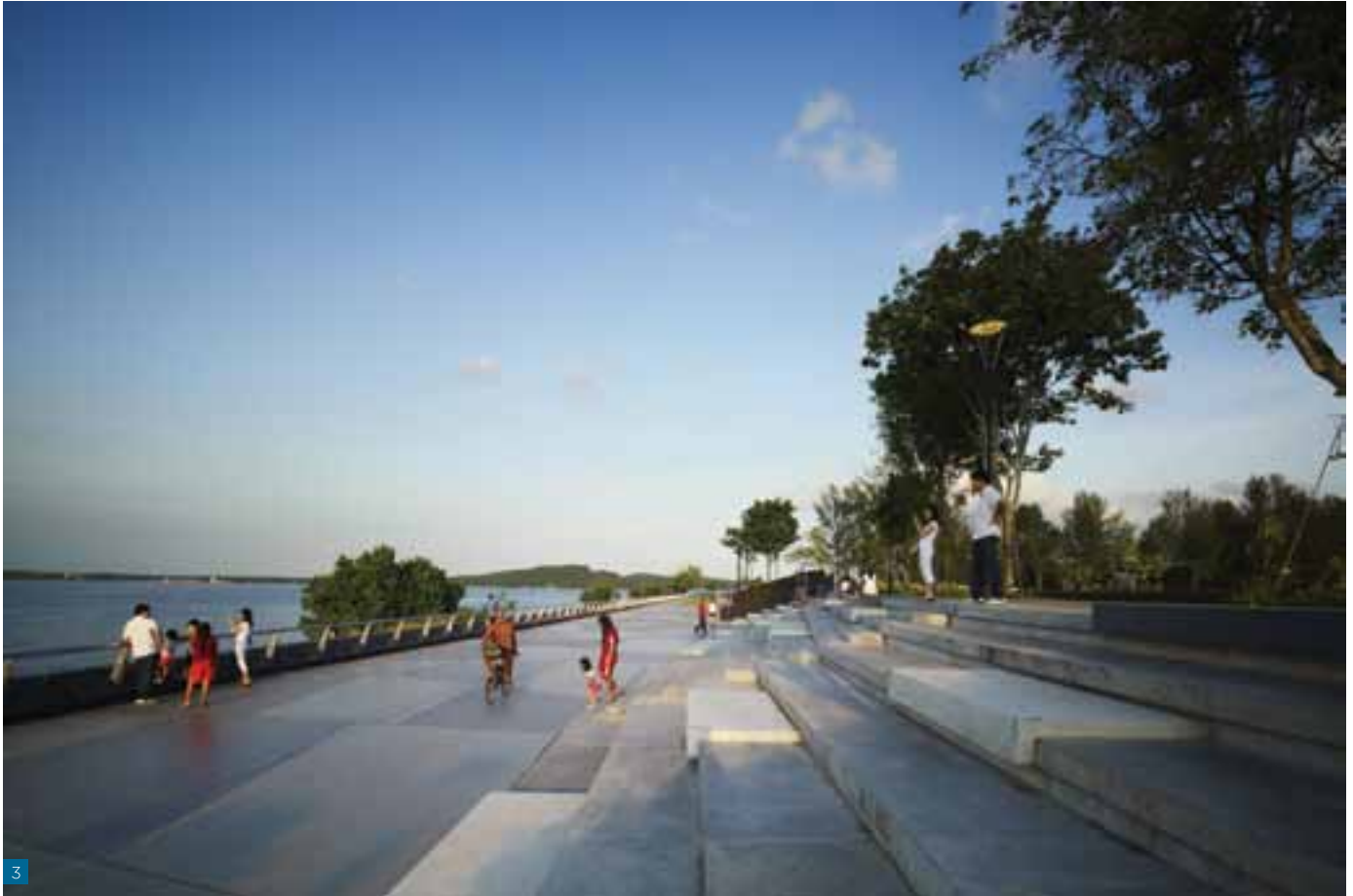
3. The delicate composition of the event plaza relates comfortably to the human scale.