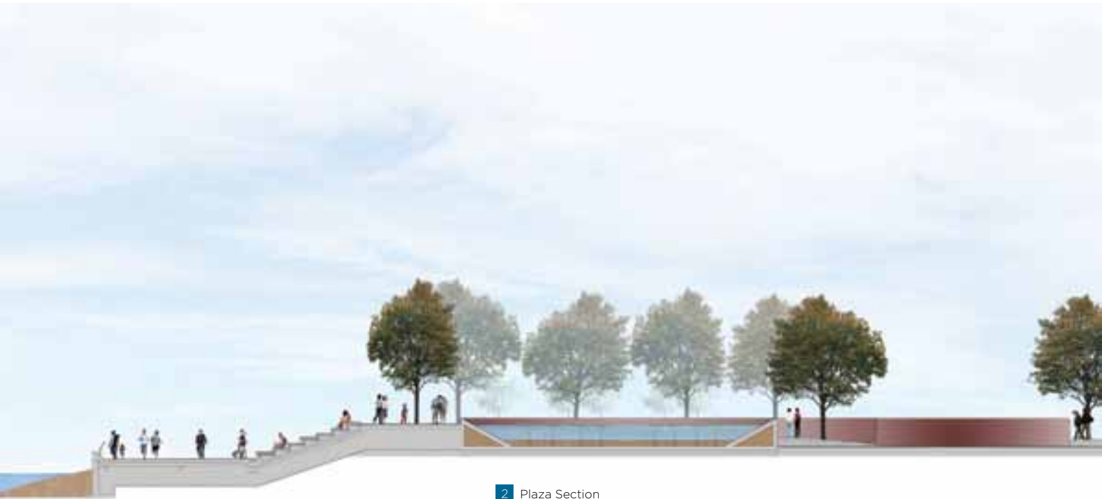
2 Plaza Section