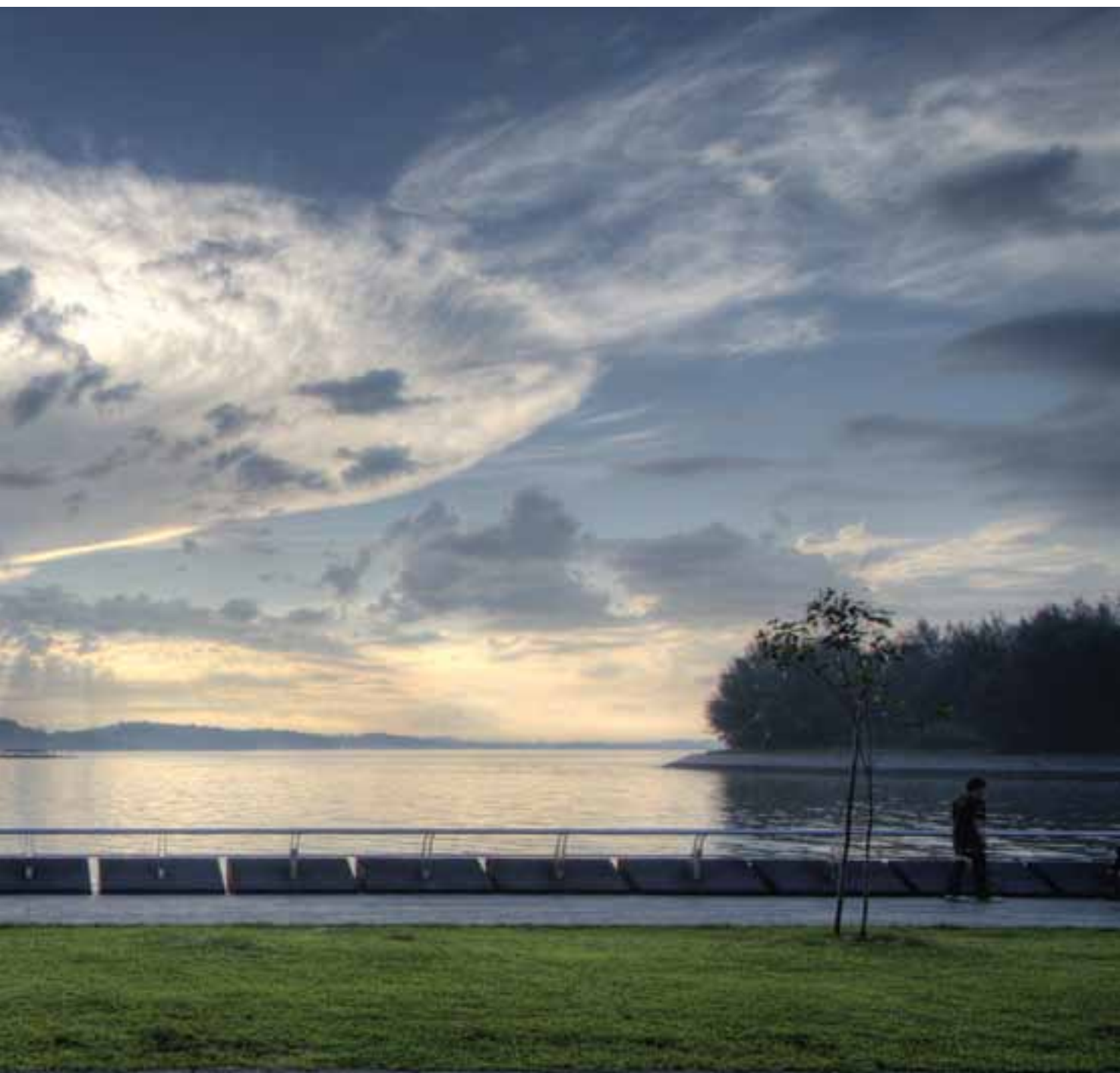
12. The linearity of the stainless steel railing sitting on black pigmented prefabricated concrete plinths mirrors the horizontality of the landscape.