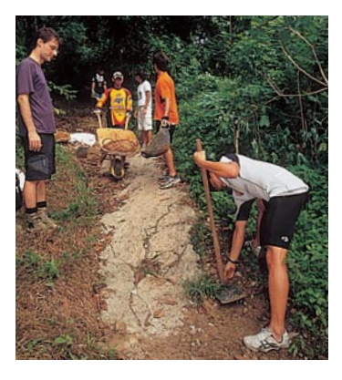
top This year, Sungei Buloh Wetland Reserve hosted more than 10,500 students via its on-going series of educational activities.

left Volunteers at Bukit Timah & Central Catchment Nature Reserves helping to repair a biking trail.