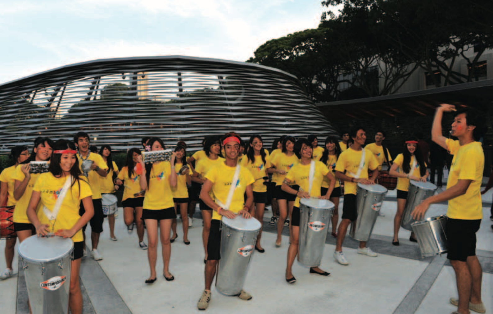
Set in the heart of town, Dhoby Ghaut Green is a vibrant event space, as well as a green lung where shoppers and passersby can rest and enjoy the verdant surroundings.

Almost half of Singapore is covered by greenery. This includes parks, nature reserves, roadside greenery and vacant stateland.