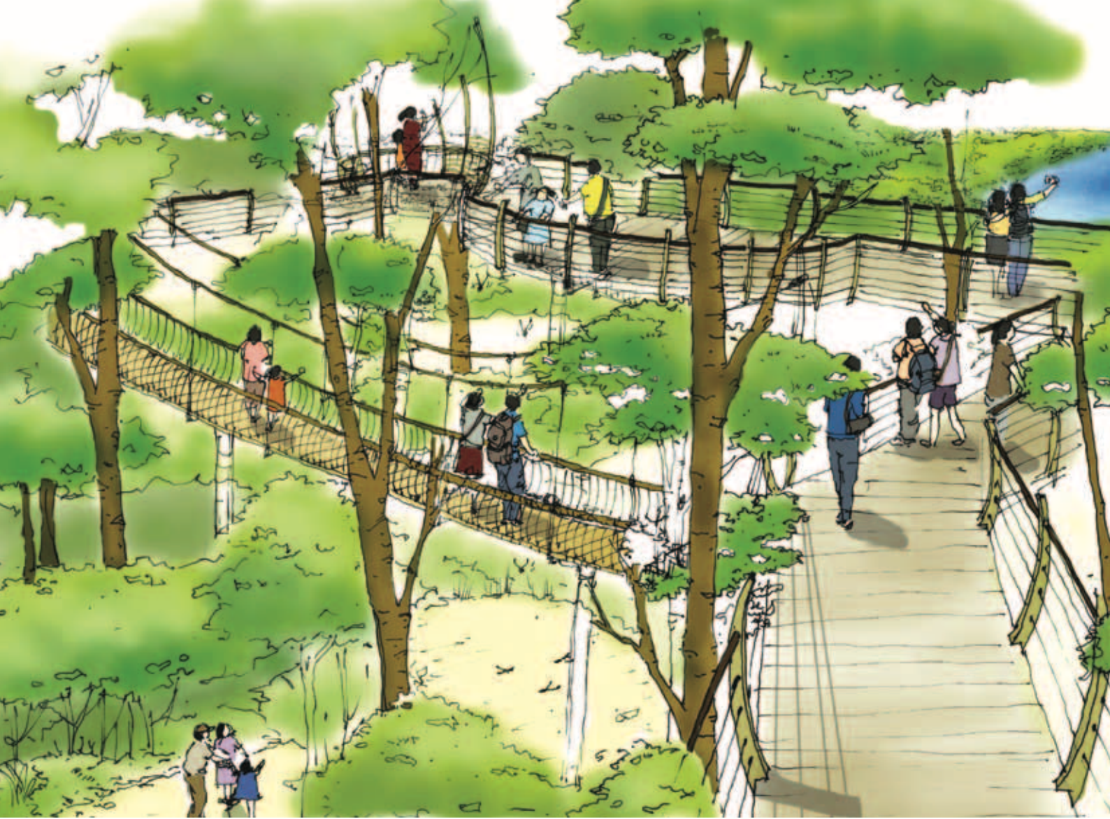
When completed, the Learning Forest at the Singapore Botanic Gardens will feature elevated walkways that allow visitors to view and explore the forest canopy from a unique vantage point, high above the forest floor. (Artist's impression)