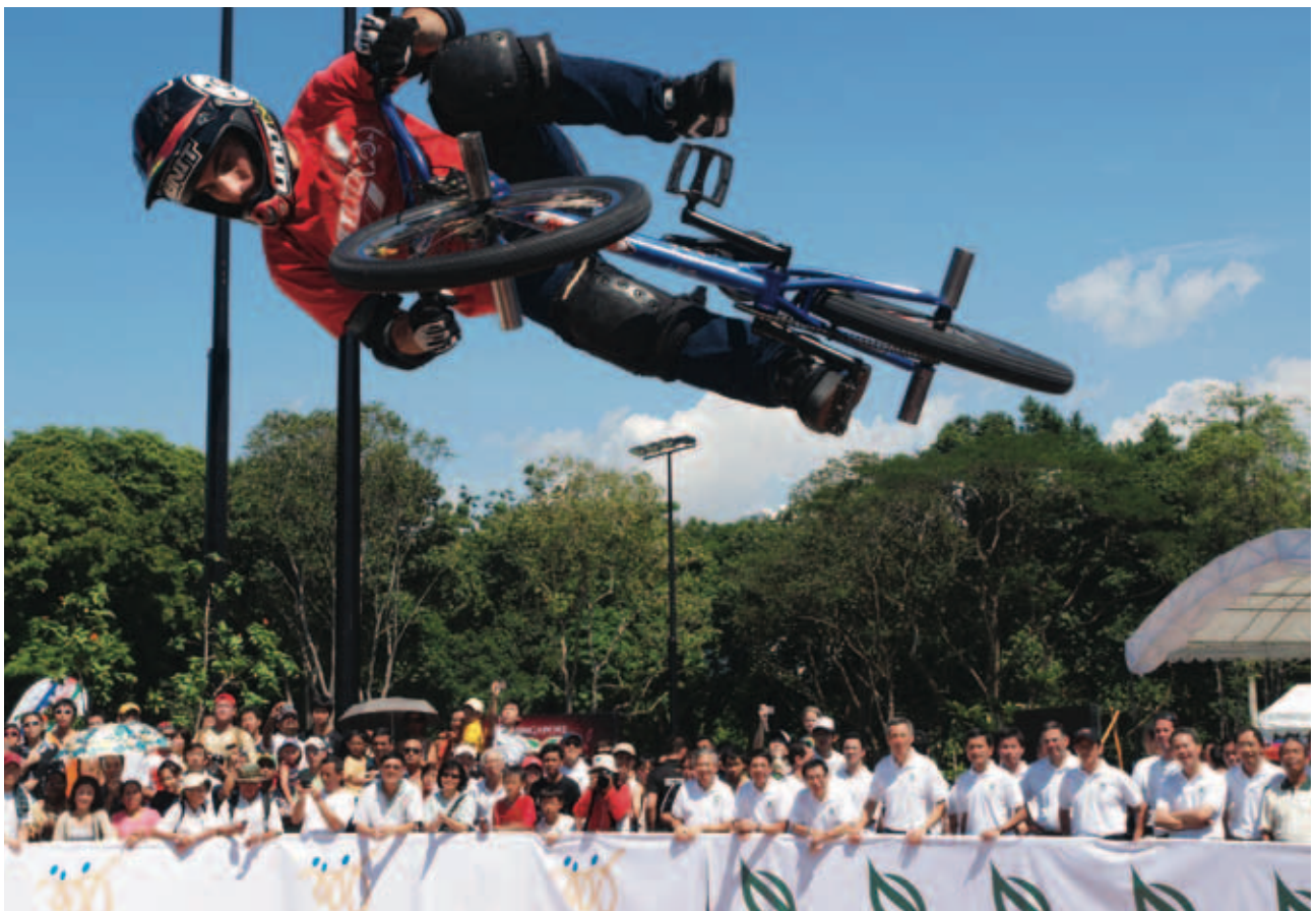
Elite professional athletes demonstrated their skills at the opening of the Xtreme SkatePark, to an audience that included Prime Minister Lee Hsien Loong, Minister for Community Development, Youth and Sports Dr Vivian Balakrishnan, and Minister for National Development Mah Bow Tan.