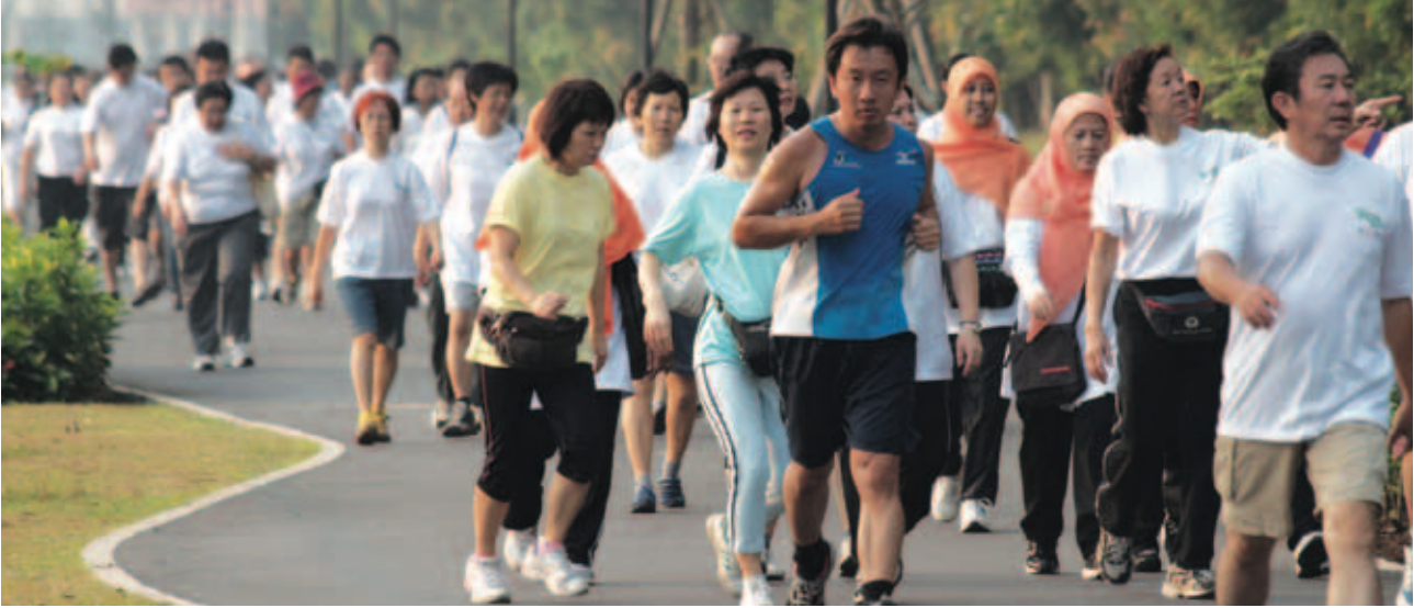
The Western Adventure PCN caters to all types of users, from adventure-seekers to nature lovers and families. It is part of the overall Park Connector Network which brings people closer to parks and nature areas, enhancing recreational opportunities for all.