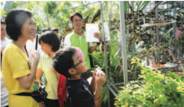
At the Butterfly Garden, visitors can observe and experience the different stages of metamorphosis through a viewing window. They can also enjoy guided walks into the enclosed area.

The Butterfly Garden also serves as a living laboratory for NParks' Butterfly Species Recovery Programme. Here, research can be conducted on the compatibility of plant species to the breeding of some variants of butterflies. These include the Clipper ( Parthenos sylvia ) and the Common Sergeant ( Athyma perius ), which are extinct in Singapore.