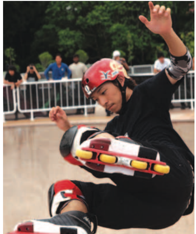
Besides standard obstacles like stairs and handrails, the skate park features a 3.6 metre deep vertical bowl where seasoned in-line skaters and BMX freestyle enthusiasts can defy gravity.

This project has enhanced Singapore's standing on the international extreme sports scene, and serves as a platform for youths to showcase their skills in the disciplines of Aggressive In-Line Skating, BMX Freestyling and Skateboarding.