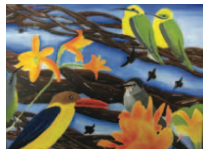
BLOOMING IN HARMONY Shih Yong Ling Priscilla

The purple blooms receding in space reflect a mood of happiness, calmness and beauty – the effect that nature has on us.