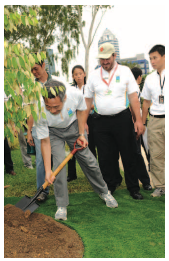
At the launch of CGS 2010 on 30 October 2009, Prime Minister Lee Hsien Loong planted a Bayur Bukit ( Schoutenia accrescens ) tree in HortPark.

Also launched at CGS 2010 was the second edition of Trees of Our Garden City, which covers a wide range of the urban trees commonly encountered in Singapore. Besides 150 trees and palms in full colour, this book also features three new chapters – 'Our Garden City Story', 'Tree Biology', and 'Trees and the Environment' – which provide readers with a broader perspective of the functions of trees in Singapore.