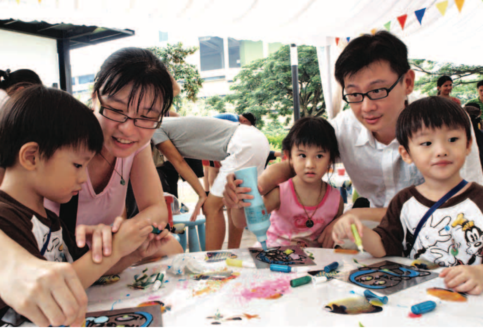
Our newsletters keep park users informed of upcoming events and activities for all ages. These provide a myriad of ideas for members of our green community - adults, children and families - to enjoy themselves in our parks and gardens.

NParks stays in touch with over 60,000 online community members, through monthly and quarterly online newsletters.