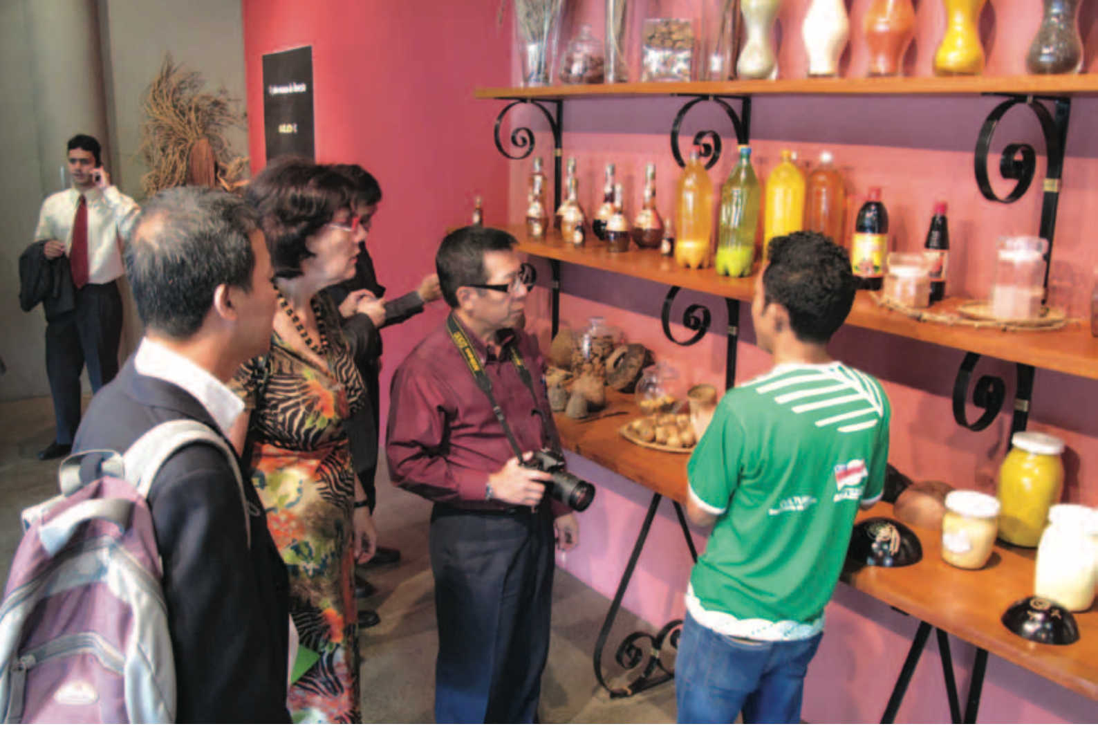
At the second Curitiba Meeting on Cities and Biodiversity in Brazil, Minister Mah Bow Tan encouraged cities to participate in the testing and refinement of the City Biodiversity Index. Here, a guide at the Cultural Centre of the Amazonia explains the uses of local products derived from the Amazon forest.