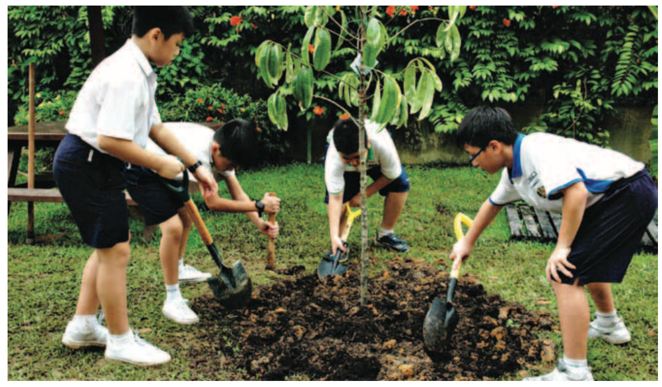
Children from St Gabriel's Primary School planted three native trees of Singapore on their school grounds, as their contribution to the global Green Wave campaign.