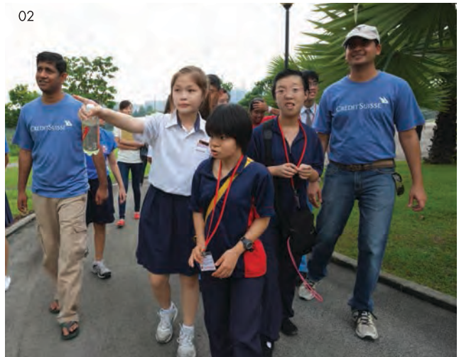
01 - 02 Nature Cares was officially launched by President Tony Tan Keng Yam at St Theresa's Home. It connects corporations, schools and the community through nature-based activities such as guided walks at Sengkang Riverside Park (right).