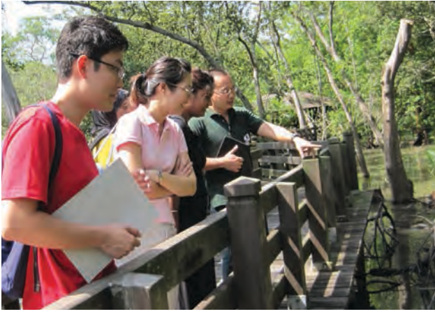
Guided tours at various nature areas are regularly conducted for educators so that they are equipped to use these places as outdoor learning classrooms.