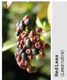
Red Leea ( Leea rubra )