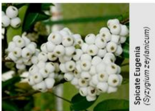
Spicate Eugenia ( Syzygiumzeylanicum )