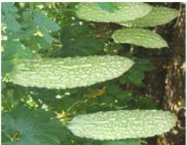
White Bittergourd ( Momordica charantia )