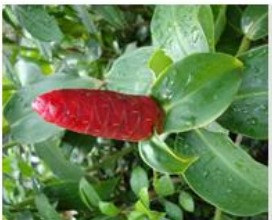
Scarlet Spiral Flag ( Costus woodsonii )