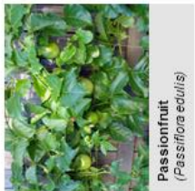
Passionfruit ( Passiflora edulis )