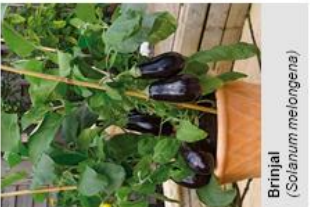
Brinjal ( Solanum melongena )