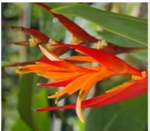
False Bird of Paradise ( Heliconia cultuars )