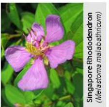
Singapore Rhododendron ( Halestoma malabaricum )