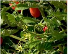
Tomato ( Solanum esculentum )