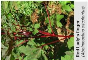
Red Lady's finger ( Abelmoschus esculentus )