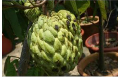
Custard Apple ( Annona squamosa )