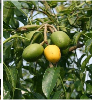
Kedondong ( Spondias cytherea )