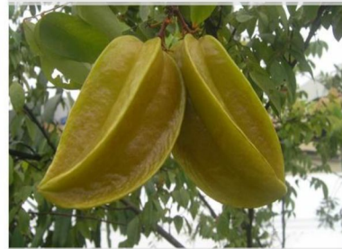
Star Fruit ( Averrhoa carambola )