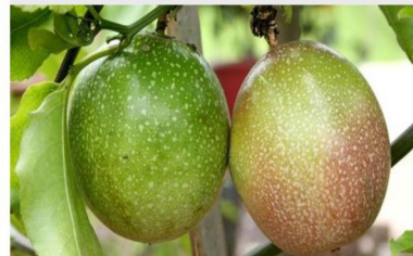
Purple Passion Fruit ( Passiflora edulis f. flavicarpa )