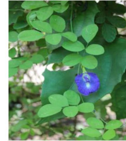
Butterfly Pea ( Clitoria ternatea )

A blue, edible dye can be extracted from its flowers and is used to make traditional Malay and Nonya kuehs.