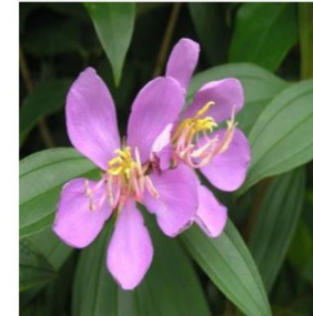
Four-o'clock ( Mirabilis jalapa )

Its seeds are used to produce a black dye while the roots produce a pink dye.