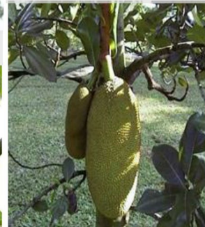
Jackfruit ( Artocarpus heterophyllus )