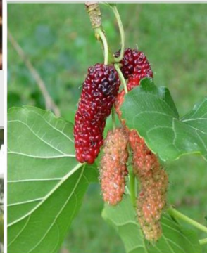
Mulberry ( Morus alba )