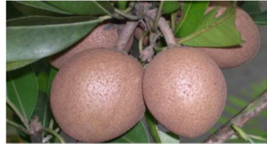
Chiku ( Manilkara zapota )