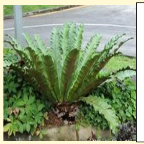
Bird's Nest Fern (Asplenium nidus) Height: 0.2m-0.4m