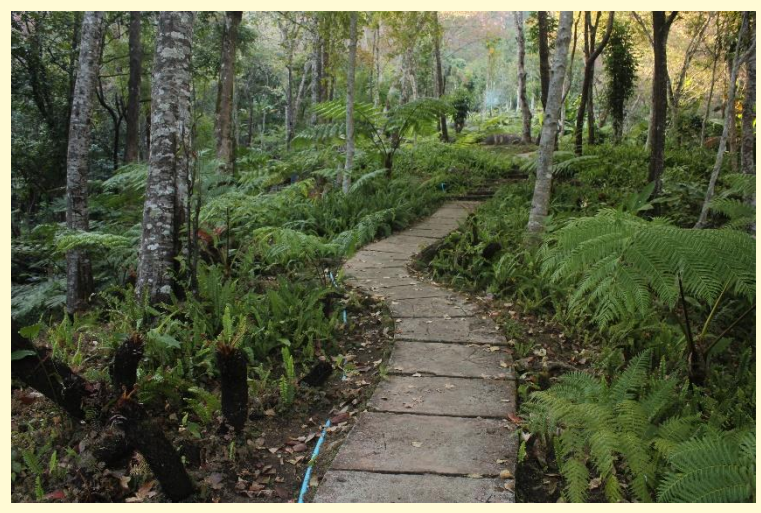
Outdoor Fernery Garden

Fernery gardens have a more natural ambience as compared to other gardens. Fernery gardens tend to do well in shady environments instead of sunny and open areas. The different textures of the ferns also complement and blend in well with each other.