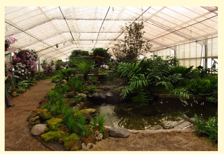
Indoor Fernery Garden