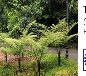
Tree Fern (Cyathea latebrosa) Height: 1m – 4m