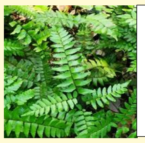
Maidenhair Fern (Adiantum latifolium) Height: 0.6m – 0.9m