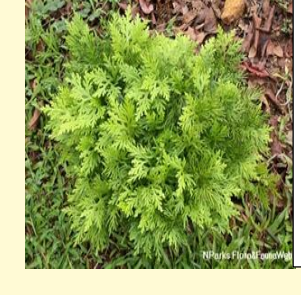
Asian Spikemoss (Selaginella plana) Height: 0.2m – 0.6m