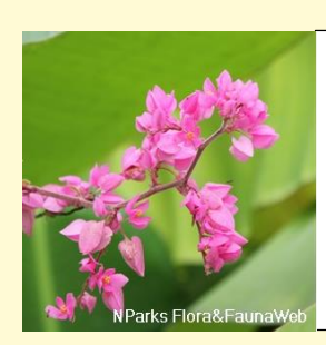
Coral Vine (Antigonon Leptopus ) Height: 9m