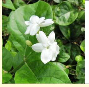
Arabian Jasmine (Jasminum sambac) Height: 3m