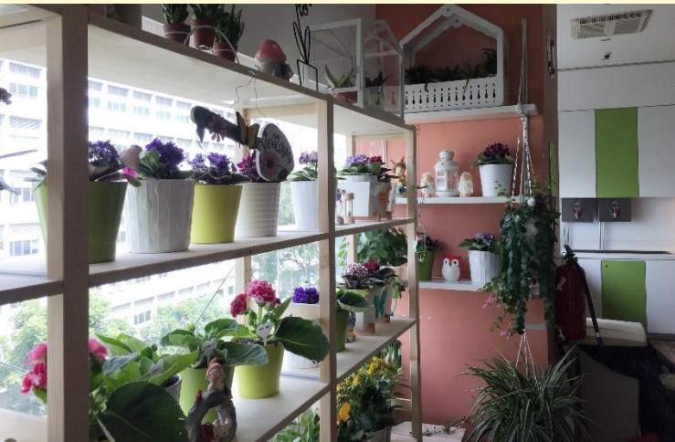
Community Garden at National Parks Board, Raffles Building