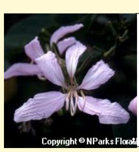
Purple Bauhinia (Bauhinia purpurea) Height: 6m-15m