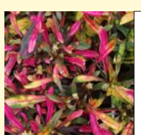
Alternanthera (Alternanthera cv.) Height: 0.2m