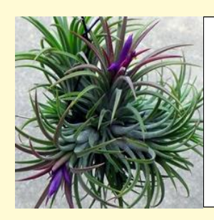
Blushing Bride Airplant ( Tillandsia ionantha ) Height: 0.1m