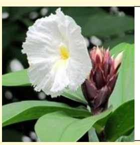
Malay Ginger (Cheilocostus speciosus) Height: 4m