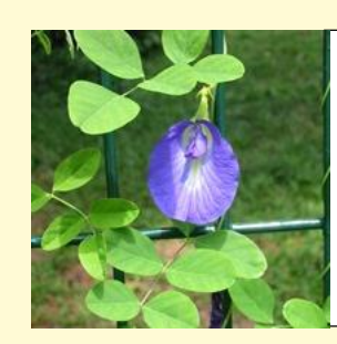
Butterfly Pea (Clitoria ternateal) Height: -