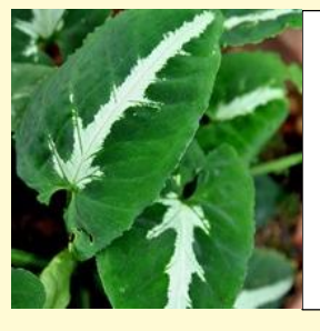
Silver Goosefoot (Syngonium wendlandii) Height: 0.5m – 0.6m