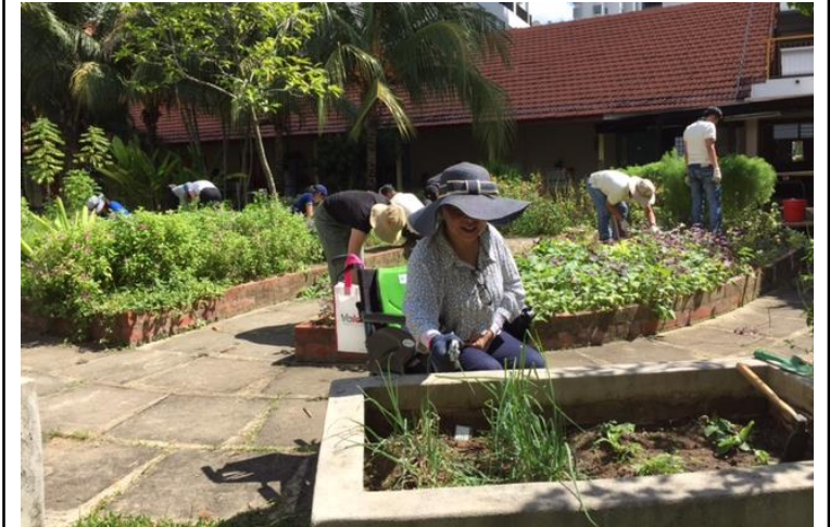
Gardening activities / events