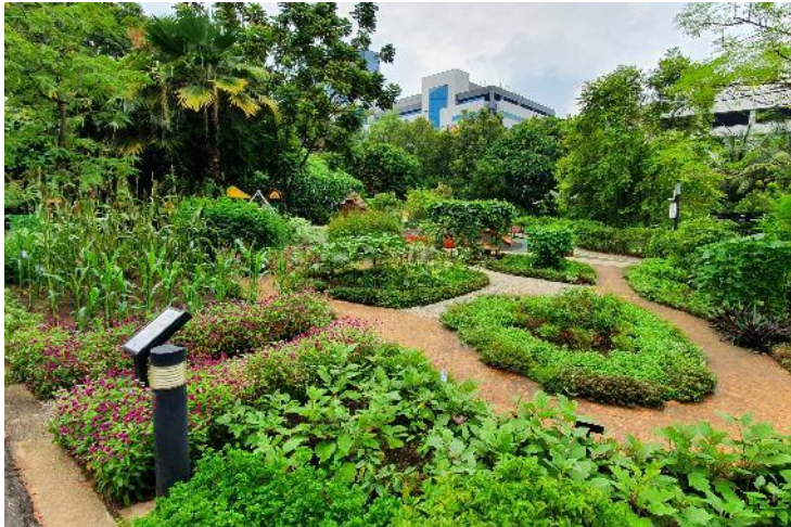
Feature shot of garden