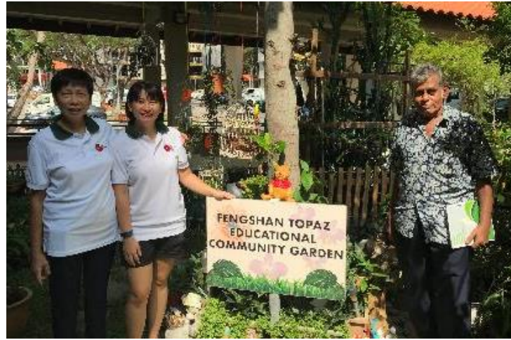
Group photo with garden signage