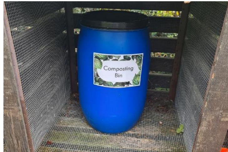
Good horticultural practice – Composting