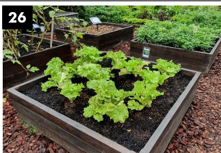
Close-up of crop rotation plants