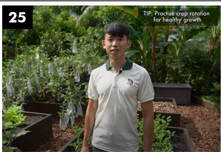
Good horticultural practice #5 – Crop rotation