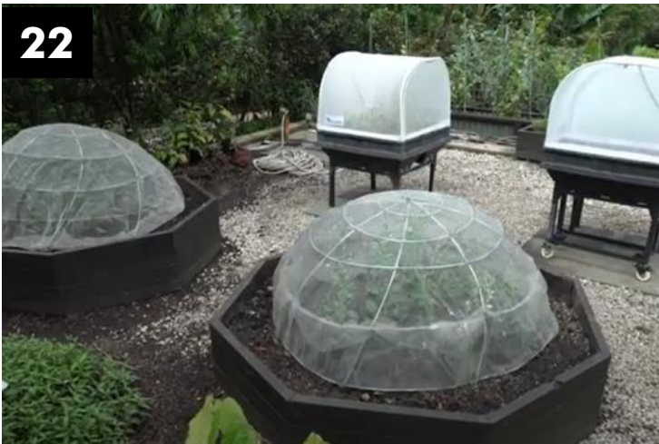
Close-up of netting