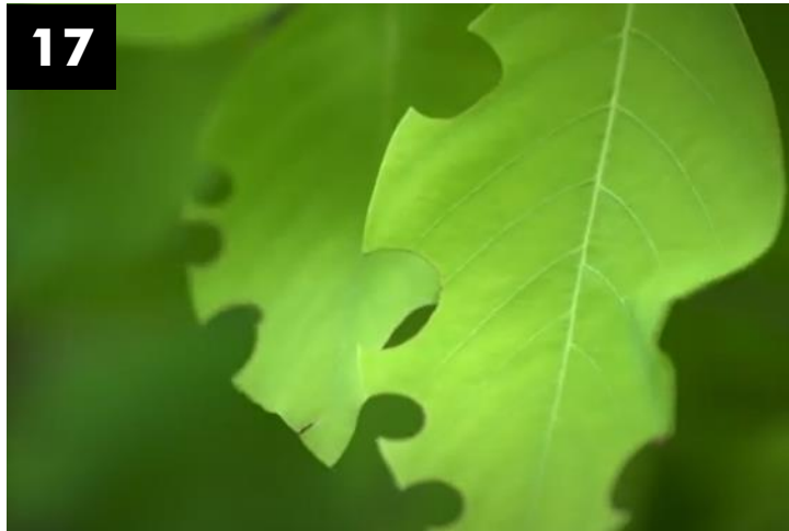
Sights of biodiversity in the garden