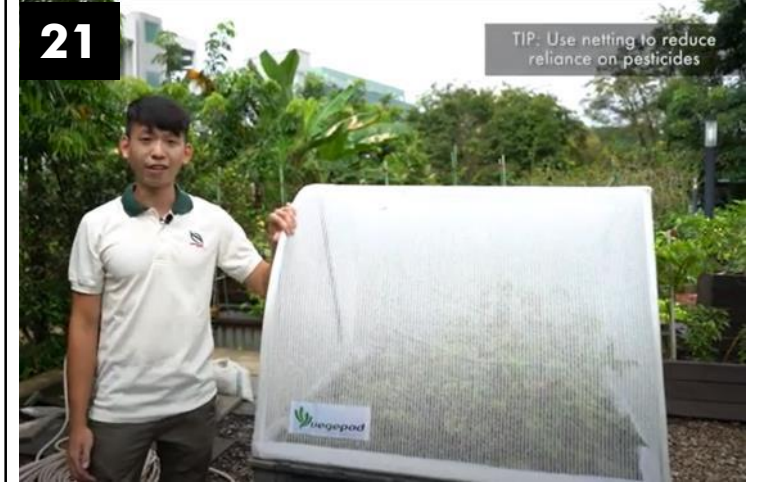
Good horticultural practice #2 – Netting

TIP: Use netting to reduce reliance on pesticides