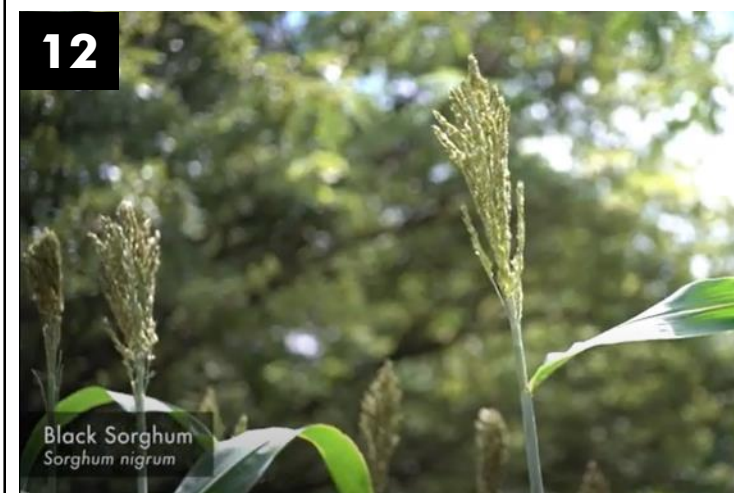
Black Sorghum Sorghum nigrum