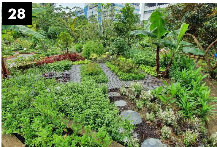
Overview shot of garden