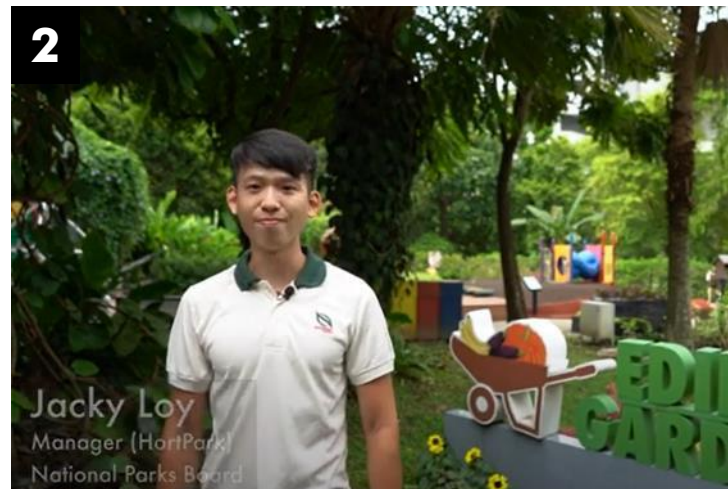
Introducing the host