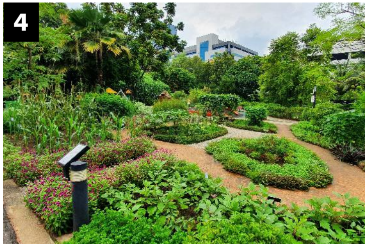
Feature shot of garden