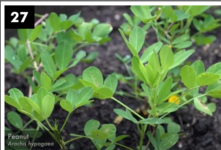
Close-up of crop rotation plants