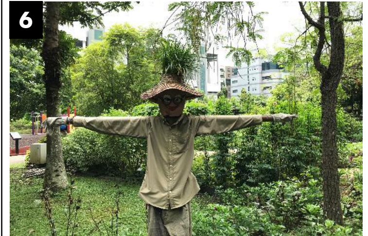
Close-up of garden focal point #1 – scarecrow