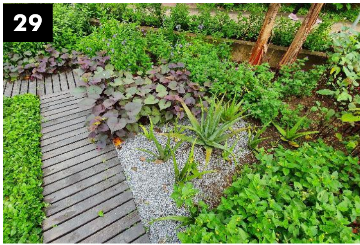
Mid shot of garden