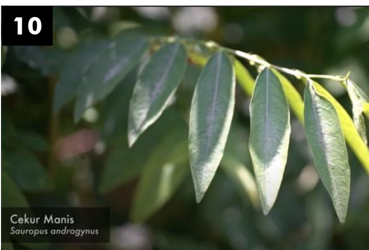
Cekur Manis Sauropus androgynus