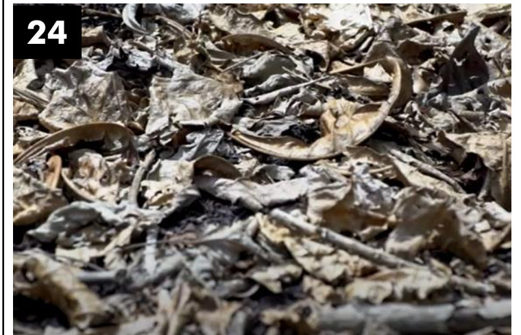
Good horticultural practice #4 – Mulching