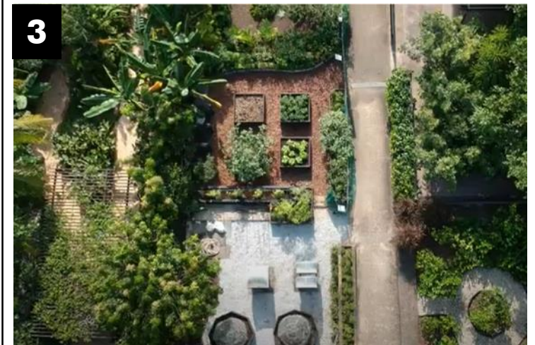
Aerial view of garden