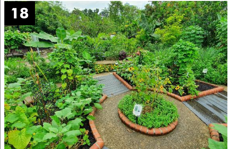
Garden focal point #3 – Three sisters companion planting