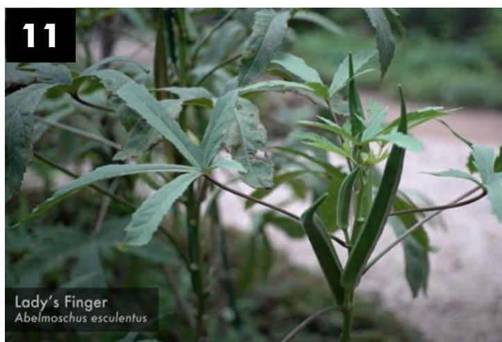
Lady's Finger Abelmoschus esculentus