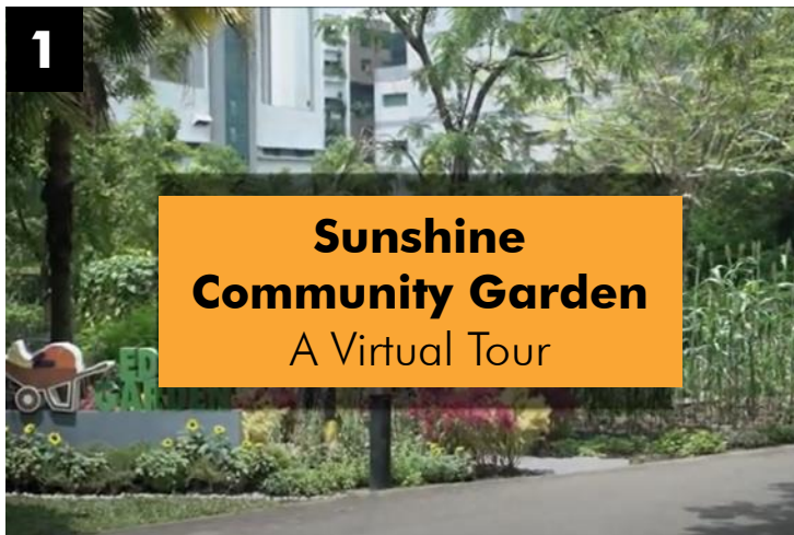
Opening title: Entrance of garden & Name of community garden