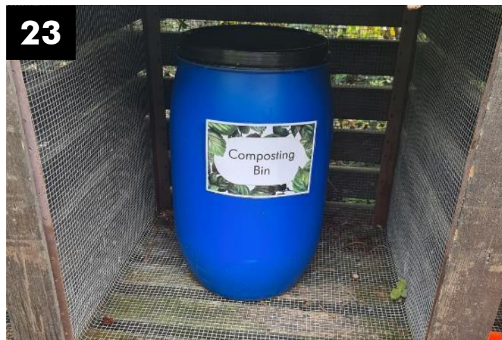
Good horticultural practice #3 – Composting