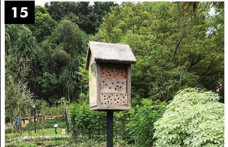
Biodiversity-friendly features: Bee hotel