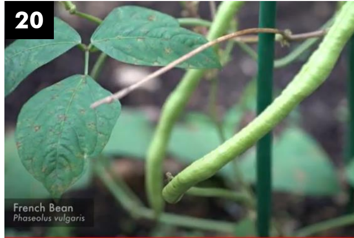
Close-up of companion planting