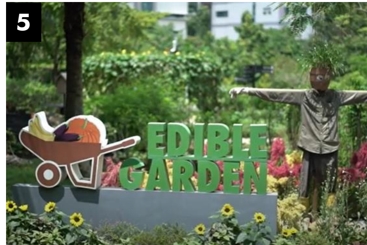
Garden focal point #1 – scarecrow