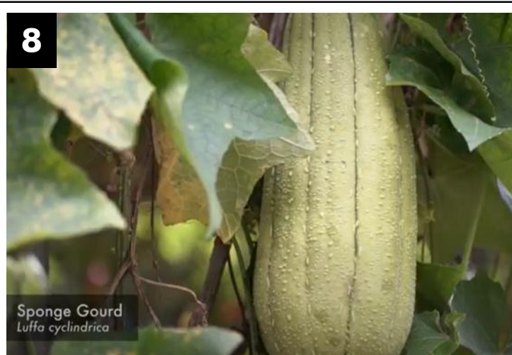
Sponge Gourd Luffa cylindrica