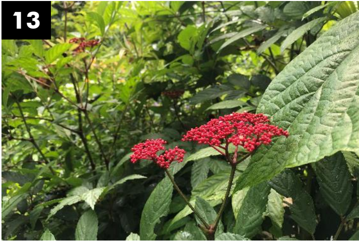
Biodiversity-friendly features: Pollinator-attracting plants in the garden