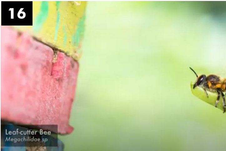
Sights of biodiversity in the garden