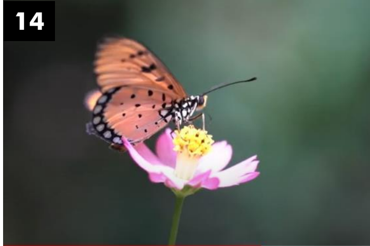
Biodiversity-friendly features: Pollinator-attracting plants in the garden