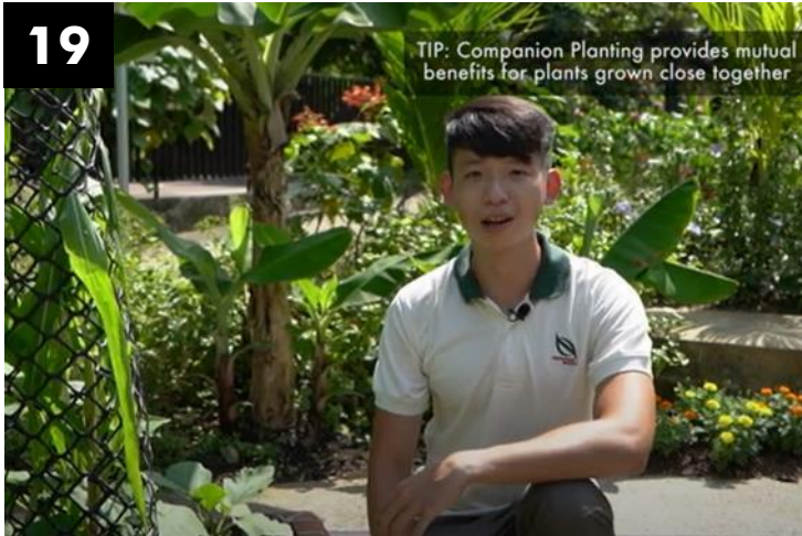
Good horticultural practice #1 – Companion planting

TIP: Companion Planting provides mutual benefits for plants grown close together