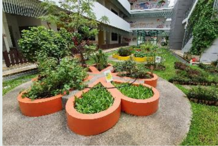
Feature shot of the garden