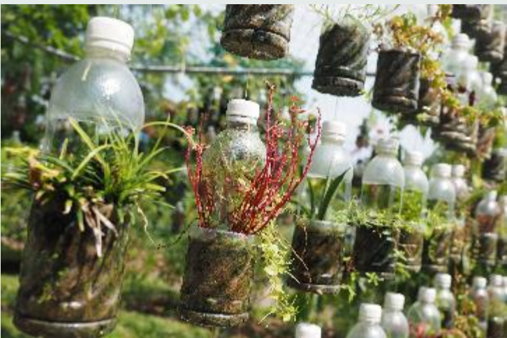
Green practices - Upcycling projects