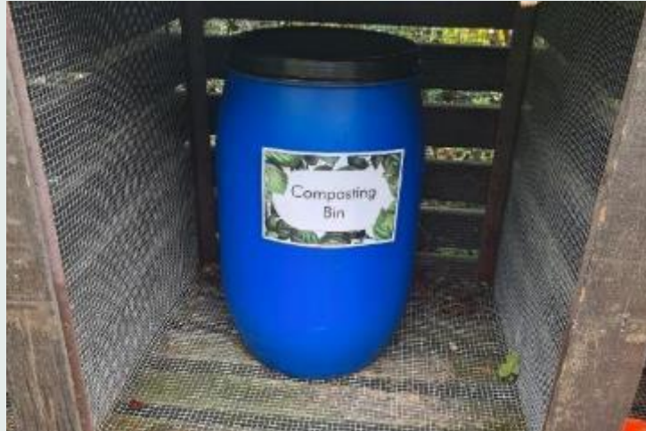
Horticultural practices – Composting