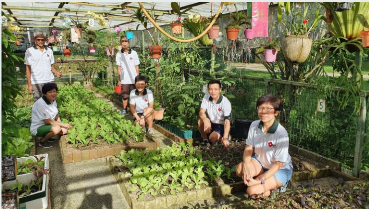
Social outreach activities/community events