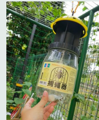
Pest control techniques - Pheromone Trap