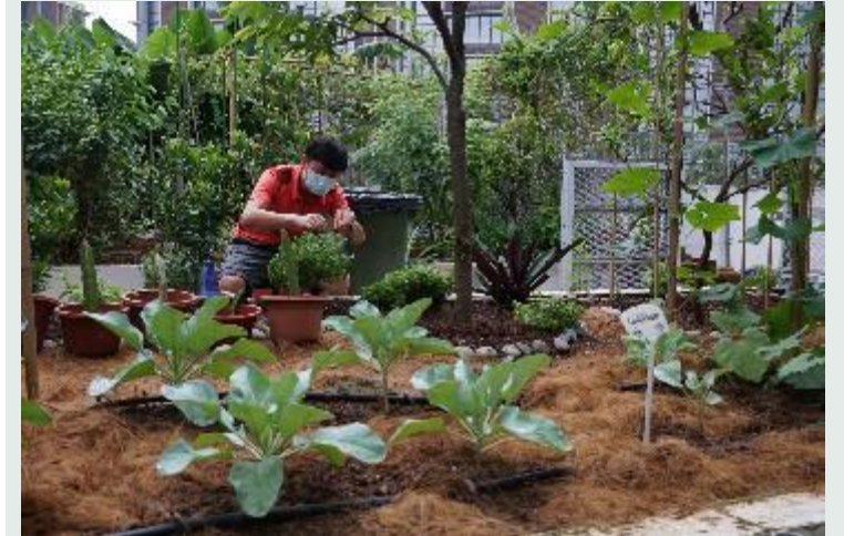
Gardening activities / events