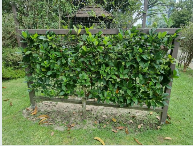
Horticultural practices - Espalier