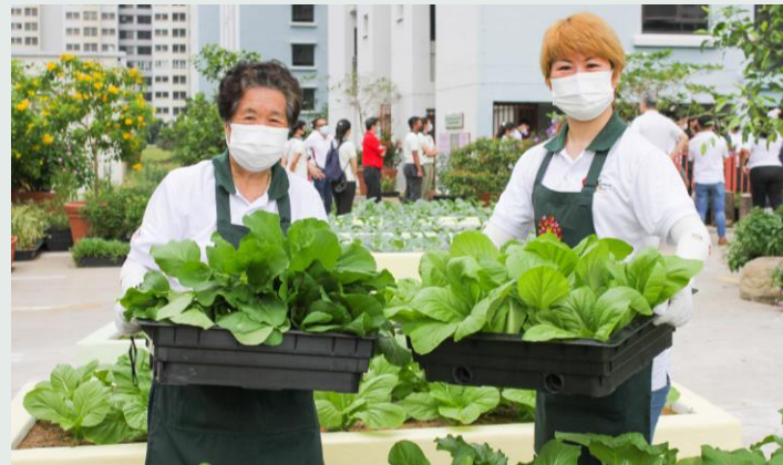
Social outreach activities/community events