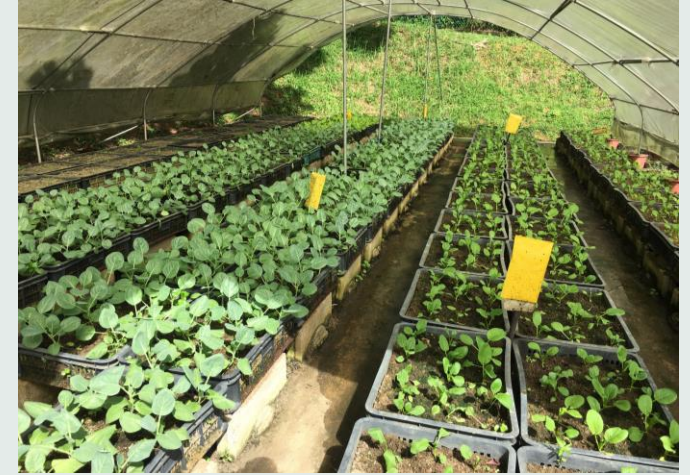
Pest control techniques - Yellow sticky paper