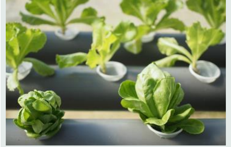
Garden innovations - Hydroponics