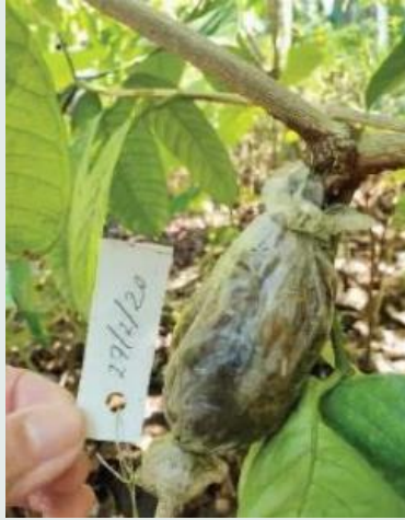
Horticultural practices - Marcotting