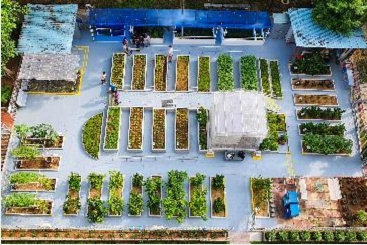
Aerial / Overall view of garden