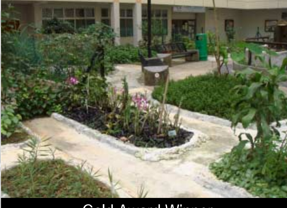
Gold Award Winner

Use of recycled materials for garden creation.