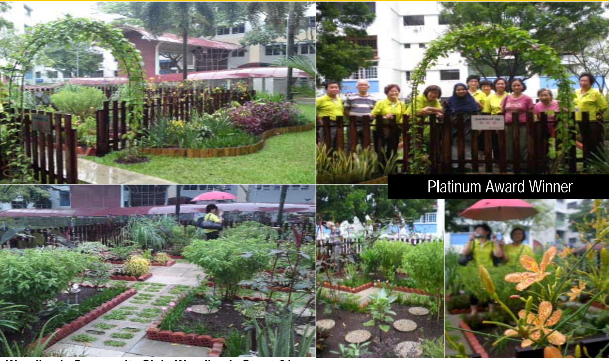
Woodlands Community Club, Woodlands Street 81

Creative garden layout, use of ornamentals among edible plants to adorn the garden, a large variety of plants, good housekeeping, clean and tidy, healthy plants free of pests and diseases, well-maintained soil, proper storage. Active gardening and related activities organised for residents.