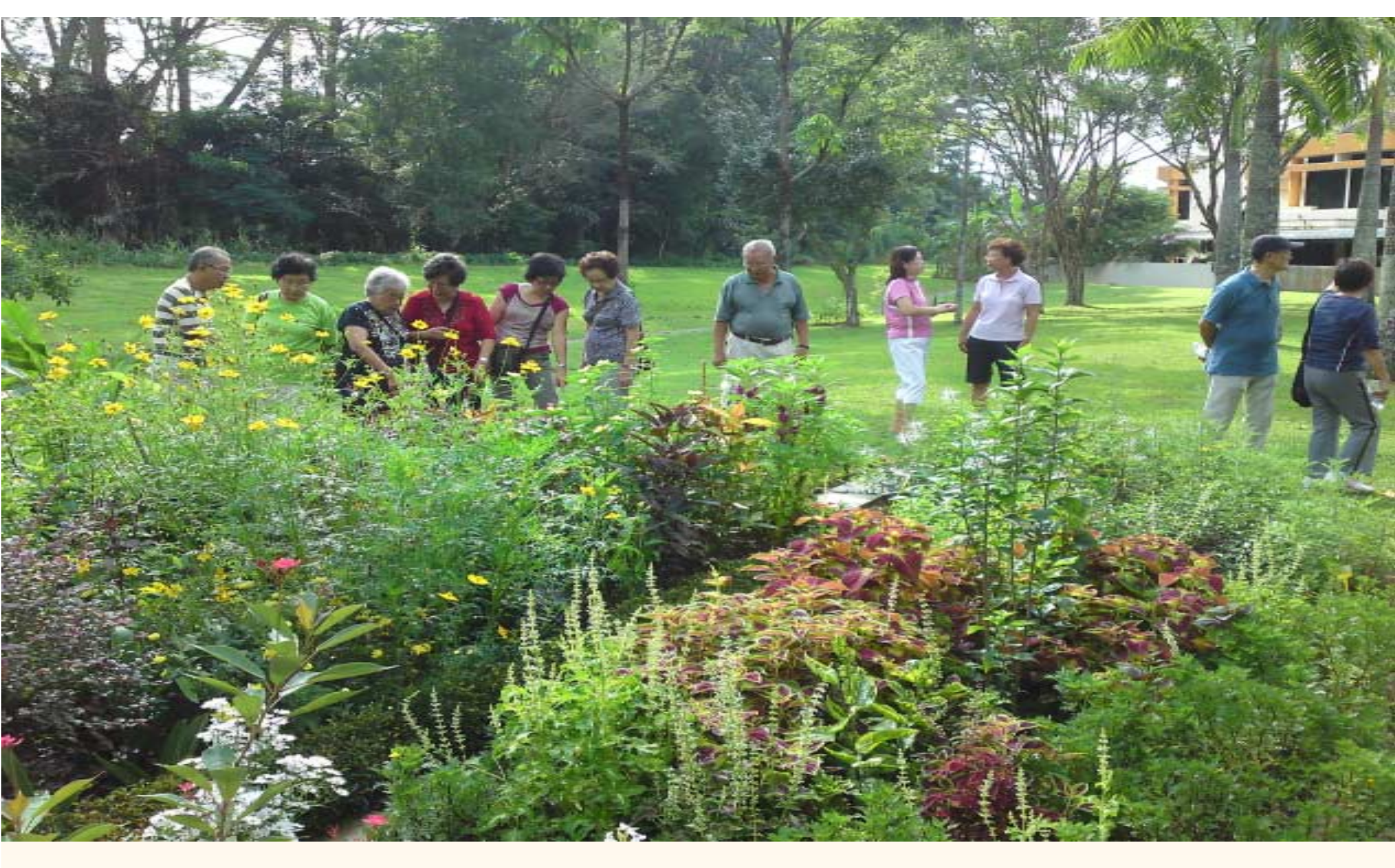
Springleaf Estate NC community garden, Thong Soon Neighbourhood Park

A relatively new gardening group, this community garden is home to a variety of flowering and ornamental plants of different heights, colours and texture, which are cultivated alongside herbal and medicinal plants.