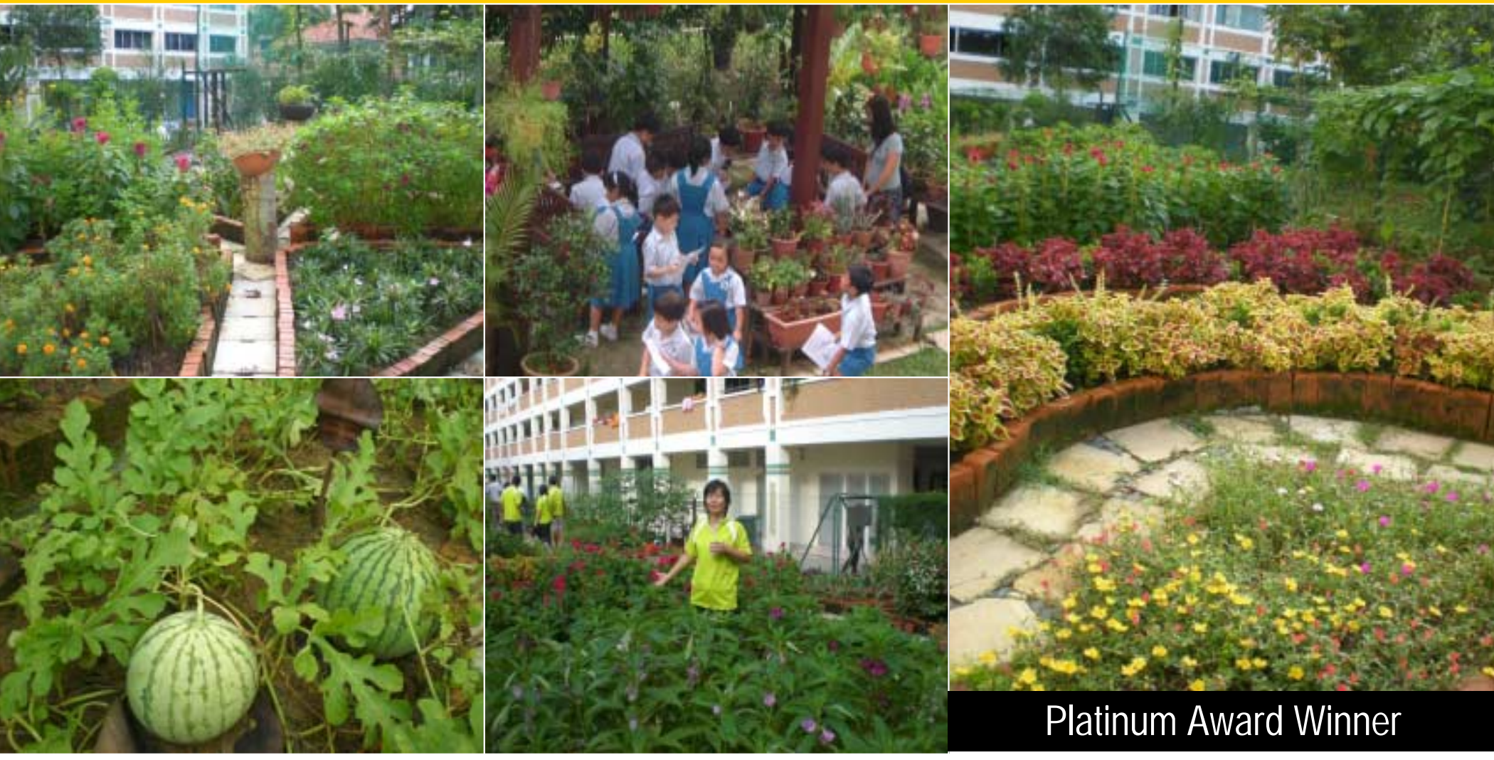
Blk 565 Pasir Ris Street 51

Creative garden layout, use of ornamentals among edible plants to adorn the garden, a large variety of plants, good housekeeping, clean and tidy, healthy plants free of pests and diseases, well-maintained soil, proper storage.