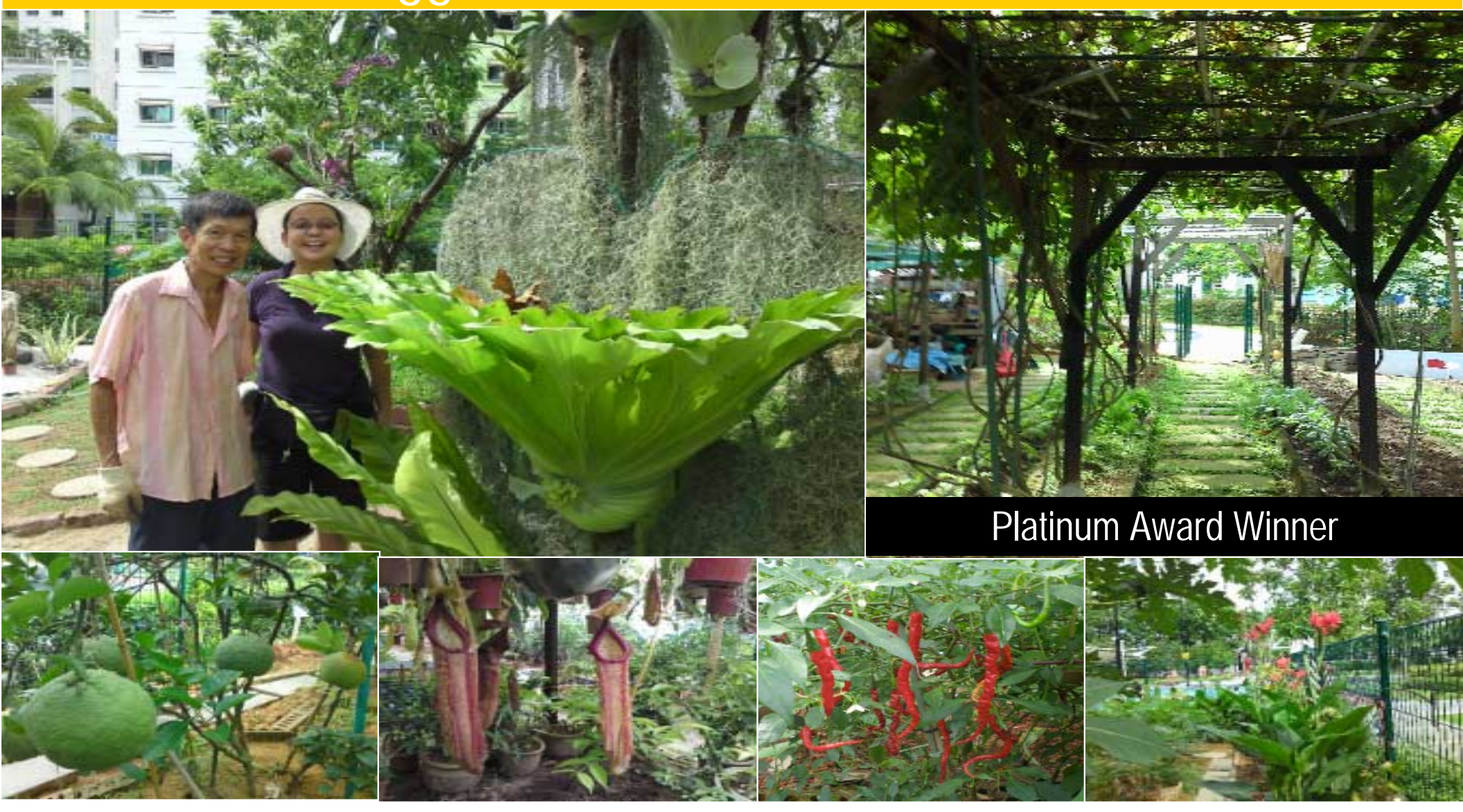
Blk 128 Edgedale Plains (Punggol)

Creative garden layout, use of ornamentals among edible plants to adorn the garden, a large variety of plants, good housekeeping, clean and tidy, healthy plants free of pests and diseases, well-maintained soil. Use of recycled materials for garden entrances. Exotic plants eg Air plants, Ferns, Pitcher Plants, grow among fruit trees, herbs, flowers and vegetables.