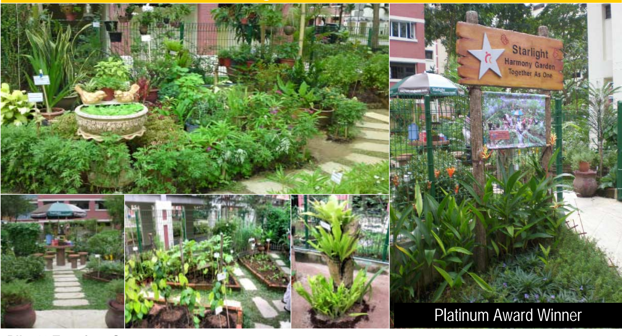
Blk 718 Tampines Street 72

Creative garden layout, use of ornamentals among edible plants to adorn the garden, a large variety of plants, good housekeeping, clean and tidy, healthy plants free of pests and diseases, well-maintained soil, proper storage.