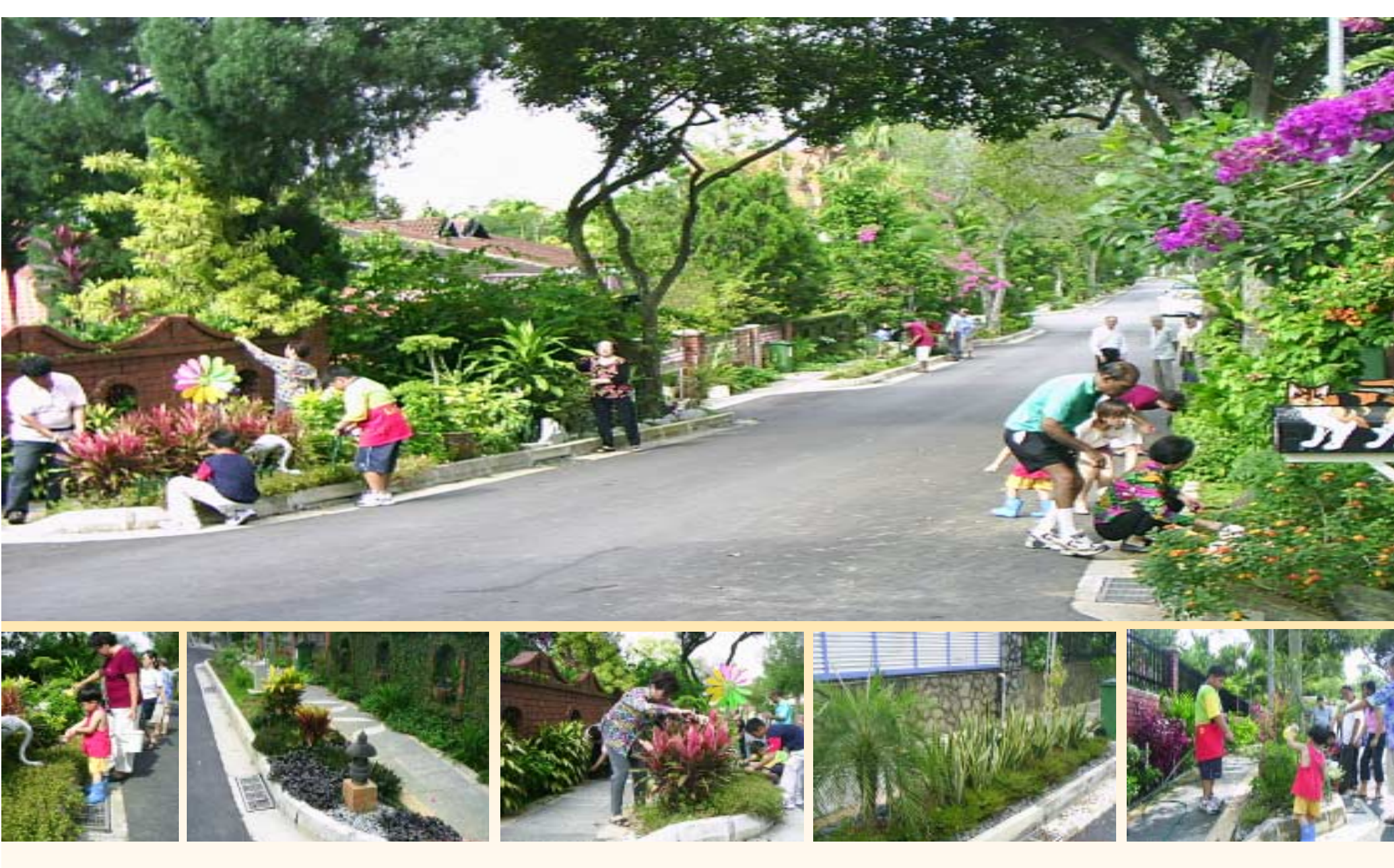
Mayfair Park Estate community gardens

The Mayfair Park Estate Neighbourhood Committee community gardening project involves over half of the 150 households in the estate. The project was successful due to effort put in by NC volunteers to encourage & sustain neighbours interest in beautifying their roadside verges in the estate.