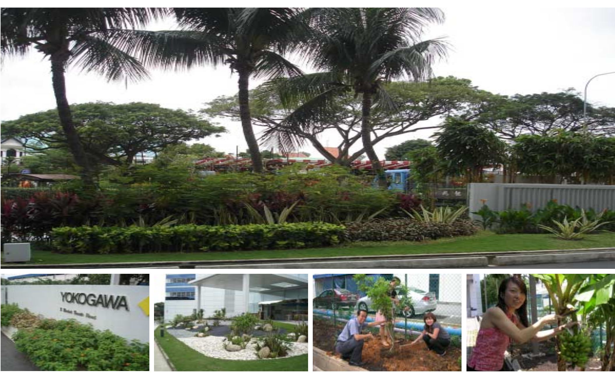
Yokogawa Engineering Asia Pte Ltd community garden, Bedok South

Blooming flowers and manicured gardens welcome workers and visitors to the factory premises of this MNC. Inside, a group of workers plant and cultivate their own herbs, spices and fruit trees. A garden at the rooftop is adorned with blooming flowers, where workers and visitors unwind.