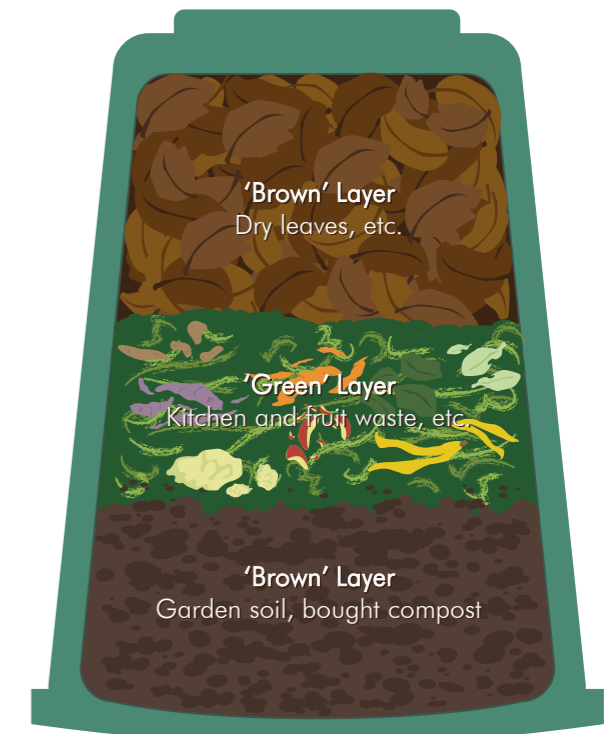
Sample recipe for setting up a traditional compost bin