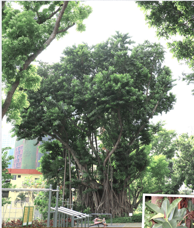
Indian Rubber Tree

The Bodhi has a broad distribution, including Pakistan, southern China, northern Thailand and Vietnam. When left undisturbed, its seedlings grow very fast. The saplings often develop on the branches of old trees, neglected buildings, crevices of walls, roadside kerbs, etc. Some Bodhi trees grow for several centuries due to their ability to produce secondary trunks continually from new shoots.