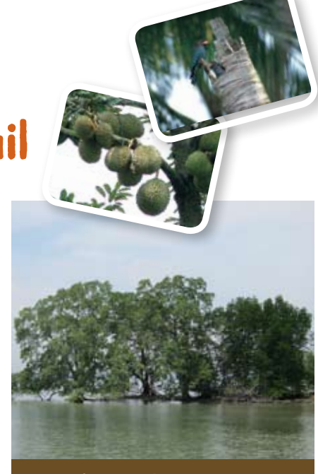
Trees of our Garden City: Enhancing Singapore's Liveability

This walking trail ends at the viewing jetty outside House No.1 (Chek Jawa Visitor Centre), a charming Tudor-style cottage with a fireplace that has been restored and designated a Conservation Building. From the jetty, view Singapore's only two mangrove trees listed in the Heritage Tree Register of Singapore. Turn around to get a picturesque view of House No.1. Linger at the jetty for a glimpse of Pulau Sekudu (Frog Island) and sweeping views of the sea.