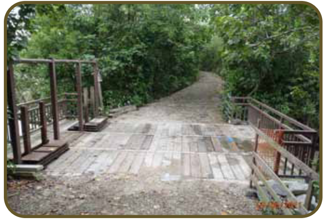
The sluice gate was lowered due to wear and tear.

As part of our reserve management, sluice gates are used in Pulau Buloh to control the water levels of our ponds. Some of these gates have been lowered due to wear and tear, and are occasionally flooded at high tides. Work was done to raise their levels. Additionally, some of the gate panels have become too weathered to keep out water completely, so these will be replaced.