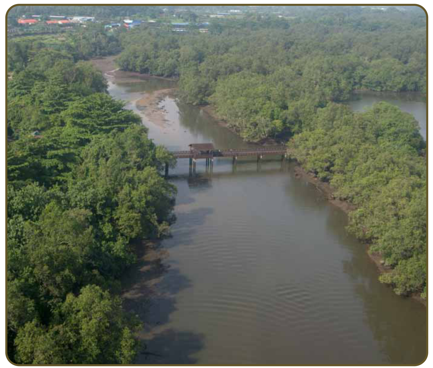
An aerial view of the Sungei Buloh Besar, along which the repairs to the sluice gates were made.