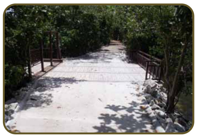
The level of the sluice gate has been raised after completion.