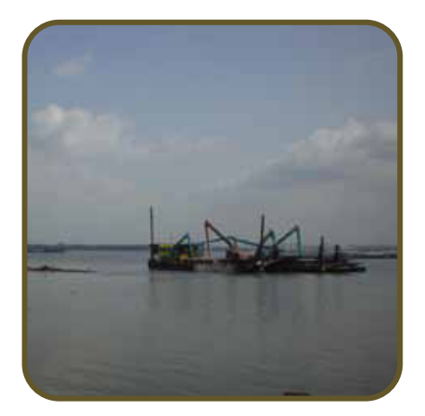
View of the work area, where a breakwater is being constructed.

A breakwater is being installed off the northeast corner of Pulau Buloh to reduce the effects of erosion caused by the waves. This consists of stones laid up to 2.9m above mean sea level, over a base made up of geotextiles (fabrics which can reinforce the structure) and concrete piles. The breakwater should create a deposition zone (an area where sediment collects naturally) behind it to eventually support mangrove growth. Mangrove saplings will be planted at the breakwater as well.