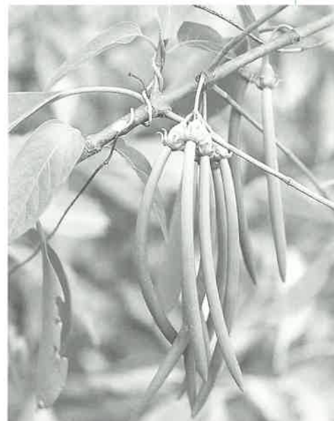
Vivipary in action

The Mangrove Boardwalk at the Visitor Centre will serve as the focal point of discovery. Remember, make a date with the mangroves during the June school vacation.