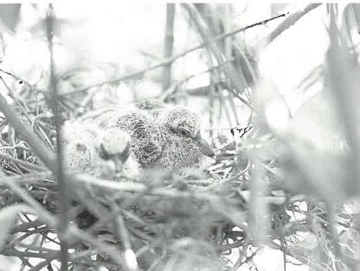
Spotted Dove Nestlings

nest-building, go to the freshwater ponds at the western part of Sungei Buloh Nature Park (Route 3). Here you will see small flocks of ten to twenty yellow and black Baya Weaver in constant motion around green spheres suspended from the tree branches.