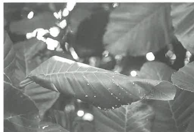
A Tailorbird nest made from a Simpoh Air leaf

Come see these resident birds at their nest-building best during the month of June.