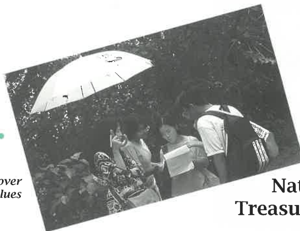
Poring over clues

We were given time to look through the clues before we were officially flagged off. The rain had subsided by then, but the trails were very muddy and there were many puddles of water to avoid. It was quite funny, looking around and realising that the other teams were also walking gingerly, trying to avoid stepping into the puddles.