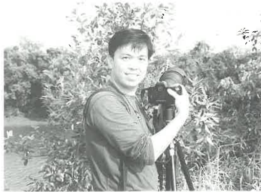
The photographer being "shot"

The photographs featured a wide spectrum of birds in action: