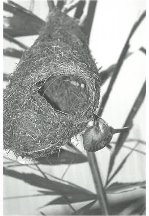
A Baya Weaver working hard to complete its nest

The next time you visit Sungei Buloh Nature Park, try to spot the avian