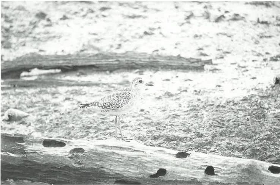
A solitary Pacific Golden Plover

The Park by night provided a completely different experience, especially for my father, brother and I, who were nocturnal visitors for the first time. We were greeted at the Visitor Centre by a large crowd of volunteers and staff from the Park, in time to witness the tagging of a Collared Kingfisher and Pacific Golden Plover.