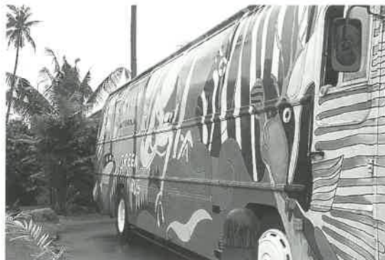
The Green Bus: all things bright and beautiful

After lunch, students toured the Motorola Green Bus. Prize-giving for the morning's winners and presentation of plaques to the participants of "Our Waterways" programme followed shortly after.