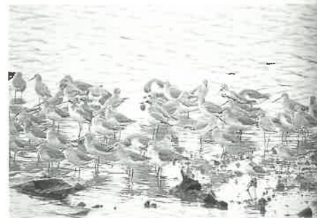
Curlew Sandpiper (longer bills) and Mongolian Plover on the mudflat

2 weeks in December 1995 were set aside for wader watching at the Main Hide. With the help of volunteer guides, telescopes were set up to allow visitors to take a closer look at the birds. Most were fascinated by these tiny birds who had made a journey of about 30 000 km to escape the cold harsh northern winter. The younger visitors were the most enthusiastic about spotting the feathered visitors ("I can see! I can see!" became the catch phrase for those 2 weeks).