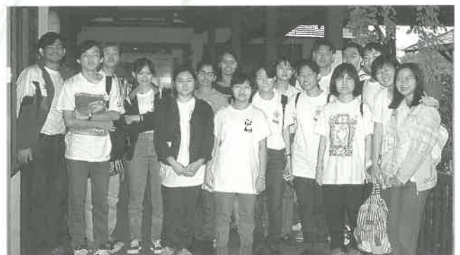
Volunteers enjoying a quiet moment

The Park stands at the mouth of a river. If we do not look after the river upstream, rubbish and debris would flow into the Park and disturb the ecosystem. A lot of effort, time and money has been spent in cleaning up our water courses in Singapore. Aquatic life has returned to waterways which were once so polluted that the water in them was black and smelly. Through the "Our Waterways" programme, schools