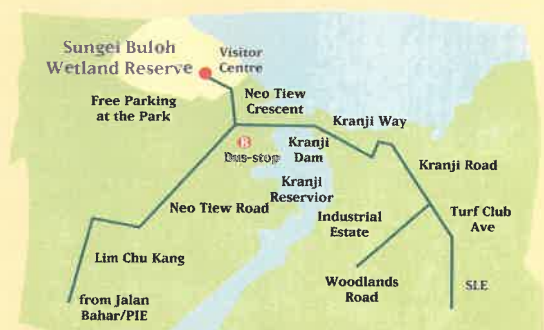
approach routes for motorists

Sungei Buloh Wetland Reserve 301 Neo Tiew Crescent Singapore 718925 Tel: 6794 1401 Fax: 6793 7271