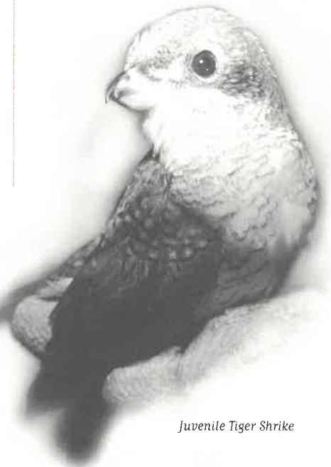
Juvenile Tiger Shrike

the enabling of longevity records and the active survival of bird species to be determined. These records are provided in Table 2. Of interest, a Marsh Sandpiper ringed on 31 Oct 90 and recaptured in the reserve on 23 Jan 01, an interval of just under 123 months, beat the previous record held by a Common Redshank by 2 months. However the record was wrested back by another Common Redshank later in the year. This individual was ringed in the Park on 30 Oct 90 and recaptured on 29 Nov 01. The interval of 133 months (11 years) is believed to be the longest recorded for the species. The oldest recapture of a non-migrant was a Collared Kingfisher ringed in Jul 94 and recaptured in Jun 01, an interval of almost 84 months (7 years). This is the same individual that held the previous record of 73 months (6 years) as was reported in the bird ringing report for 2000.