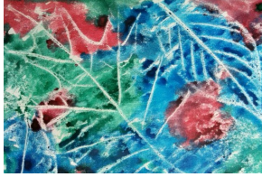
Textures around me.

Tick the activities that you have completed.