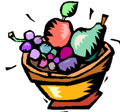
Fruits in the garden