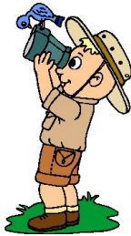
I spy with my little eyes