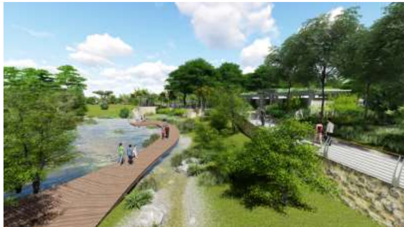
[Artist impression: Courtesy of National Parks Board]