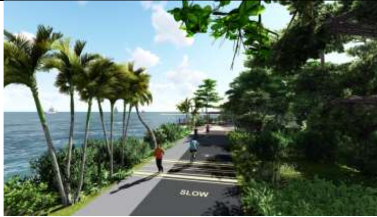
[Artist impression: Courtesy of National Parks Board]