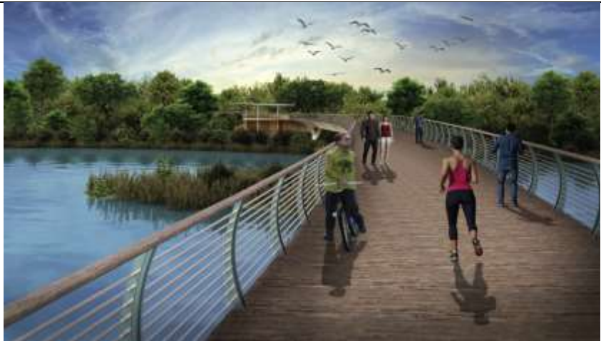
[Artist impression: Courtesy of National Parks Board]

Sengkang Riverside Park, which will feature a cycling bridge that connects the eastern end to the western end of the Park.