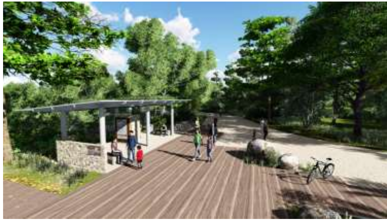
[Artist impression: Courtesy of National Parks Board]