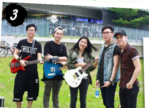
Trust The Chaos