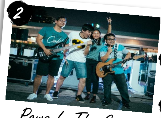
Paws In The City