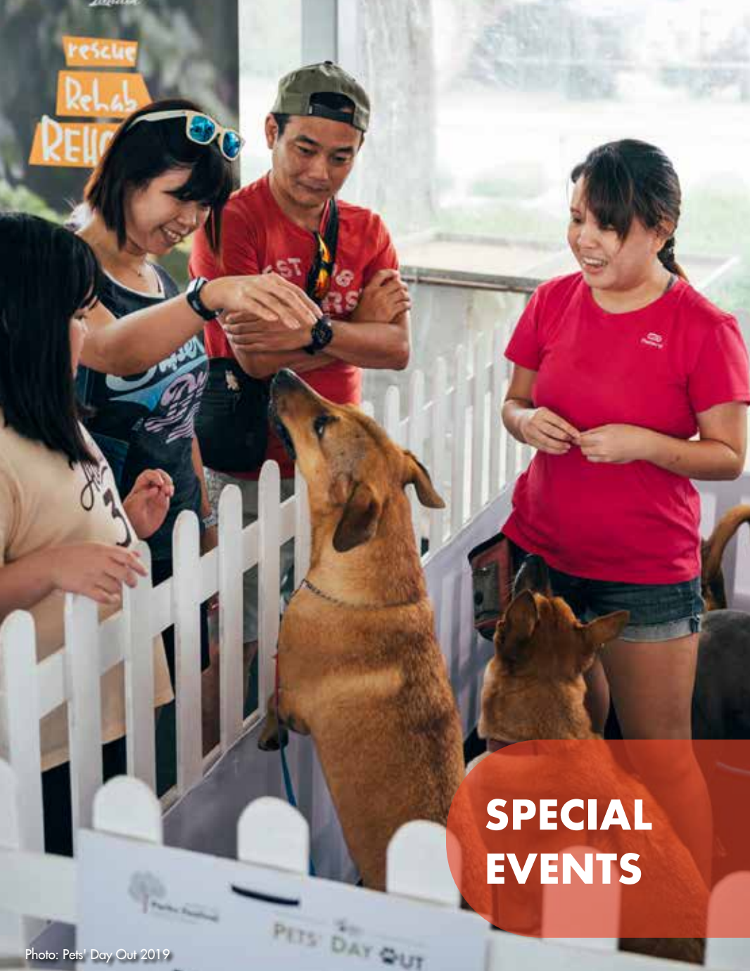
Photo: Pets' Day Out 2019