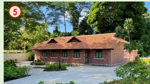
The Railway Staff Quarters has been restored and adapted from a semi-detached house into a food and beverage establishment.