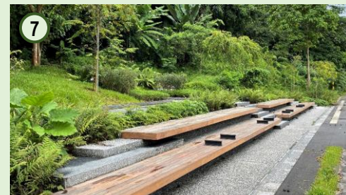
The Seating Terrace & Ramp is a resting spot with a panoramic view of the restored Railway Station Building at different elevations.