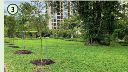
Mature trees, which grew over old bricks at the Community Lawn have been kept to provide shade to users.