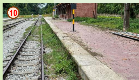
The Station's Platform and artefacts like token pole and station name sign have been restored. Ramps have been added for easy access by users of all ages and abilities.