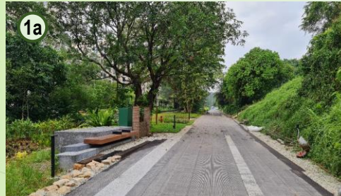
The design of newly resurfaced path mimics long-exposure photography, evoking the stilled motion of a passing train. This concept is expressed through the architecture and landscape elements.