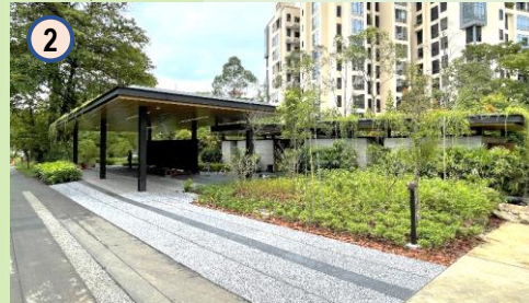
Learn about rail history while taking a break and waiting for your friends at The Yard , with green roof and solar panels.