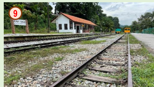
The Heritage Rail Lawn has the original three sets of rail tracks with 240 timber and 118 reinforced concrete sleepers. Two new wagons complete the nostalgic look.