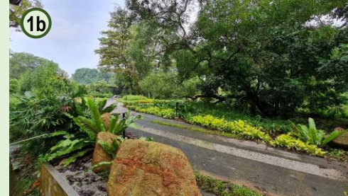
At the Entrance , the long branches of an acacia tree and the paving patterns greet and direct you into the Station.