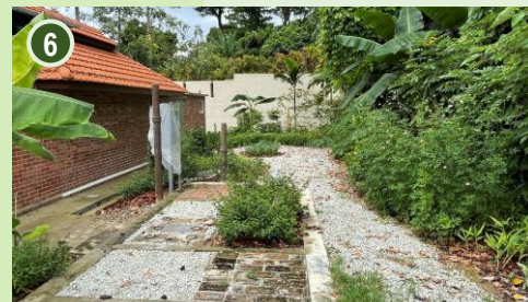
The Herb & Spice Garden showcases plants that were commonly used for homecooked dishes alongside a septic tank retained as a landscape feature.