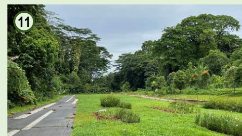
The 0.2 hectare Event Lawn is an expansive green lawn for recreation and public events.