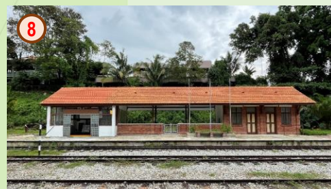
The Railway Station Building has been restored together with original spaces i.e. an office, a waiting area and the Signal Room as well as some artefacts.