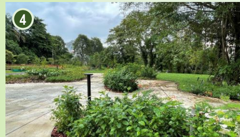
The Kampung Garden features ornamental shrubs and flowers iconic to Singapore's 1960s landscape.